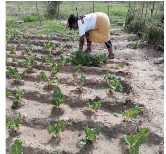
Francina tending to the vegetable garden in her backyard.

“Everything is concluded at the municipality which means there is no community participation. The community is not involved.”