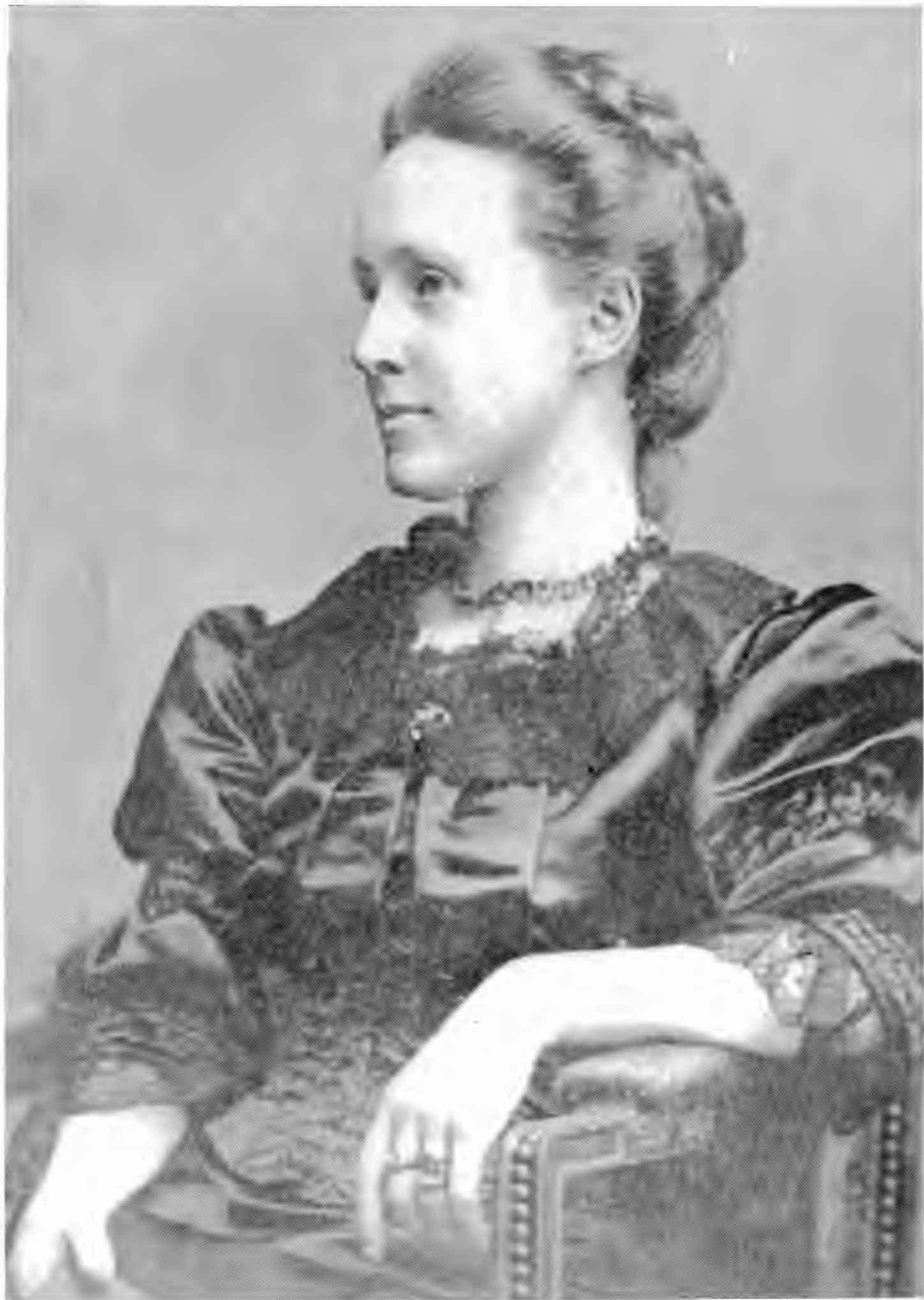
Millicent Garrett Fawcett in 1892.