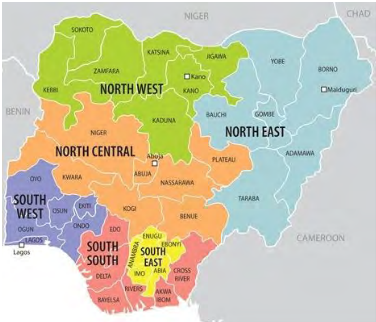
Figure 1, Source: Michael O. Sodipo, "Mitigating Radicalism in Northern Nigeria", African Security Brief , 26 (2013):2.