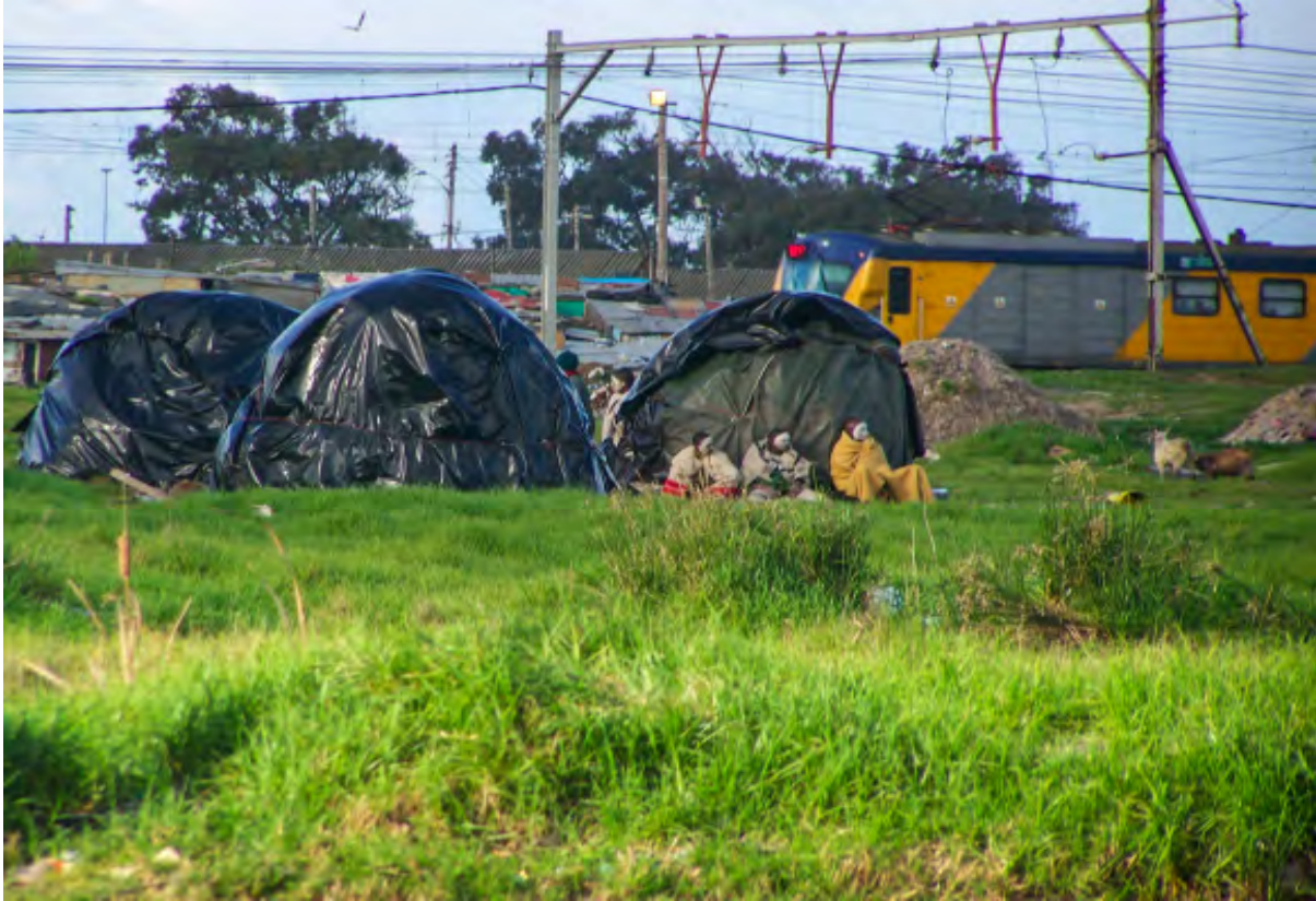
Figure 6: Young men undergoing initiation at Phola Park, Phillipi.