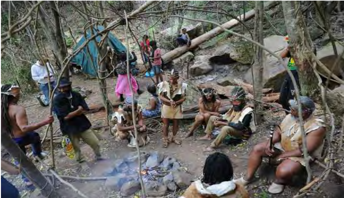
Figure 5: A group of Khoisan indigenous people who occupied Cecilia Forest on Table Mountain near Constantia Nek in their quest to Reclaim that area

has a strong spiritual link to our people, and we are occupying the mountain to create a space where we can yet again learn, and practise our culture, traditions, and language in the same spaces our ancestors did.” He was further quoted saying “our remonstrance is inspired by the desire to reclaim the mountain for Khoisan indigenous people, and to restore the Khoena Kingdom”.