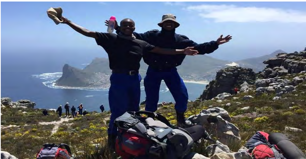
Figure 3: Chrysalis Academy participants hiking in Silvermine Section of Table Mountain National Park.