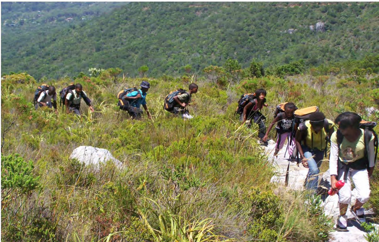
Figure 1: BEEP hike with a group of young people on Table Mountain.