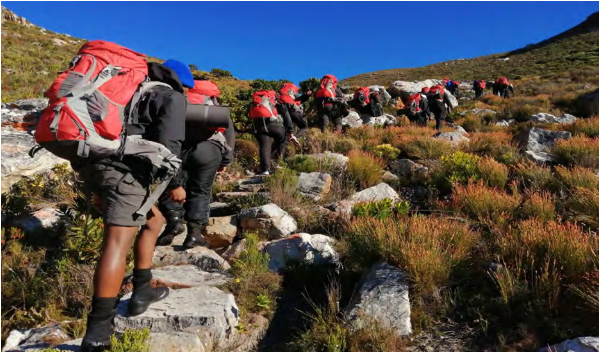
Figure 4: Participants from Chrysalis Academy hiking Table Mountain as part of its outdoor activities.

“Climbing the mountain has indeed helped me change my attitude, and it gave me a different perspective about life. I found healing from nature, but I think for healing to be found one has to be open minded, open his or her heart, and you start by forgiving yourself for everything that has gone wrong in your life. I think without doing that first, I think it would be difficult to find healing, and see change in your life”.