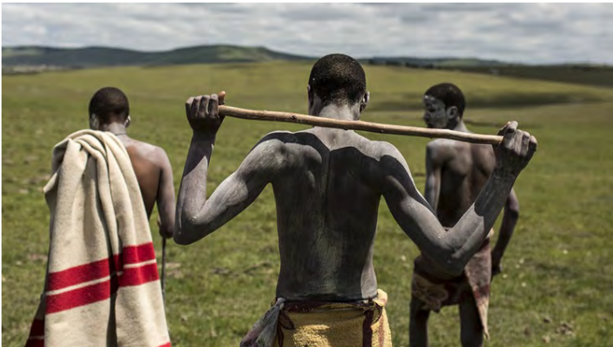
Figure 7: Initiates walking freely in the wild.

a narrative of people who lived on that land. Therefore, by placing their mark on the land, humans shape the environment according to the cultural context and, in return, the “environment shapes culture” (Eboh 2005: 1, cited in Nkonsinkulu, 2015: 69). It would be in the best interests of SANParks to build black environmentalism by offering young boys the opportunity to stay on the mountain for their ritual initiation. It would help considerably to build a black environmental public, which is sorely needed in South Africa where environmentalism overwhelmingly caters to specifically white cultural needs. It must be highlighted that fire is a vital part of the conclusion of the ritual initiation. Yet SANParks is very experienced in setting up campsites where fires can be safely lit. For example in places like Silvermine, and in particular at Silvermine Dam, it is permissible to light fires under certain conditions, as is the case also at Healey Dam.