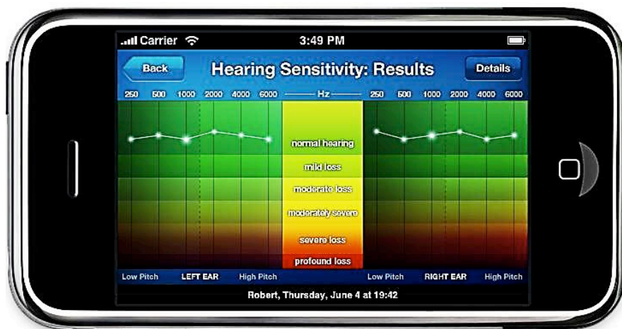
Figure 2: Audiogram