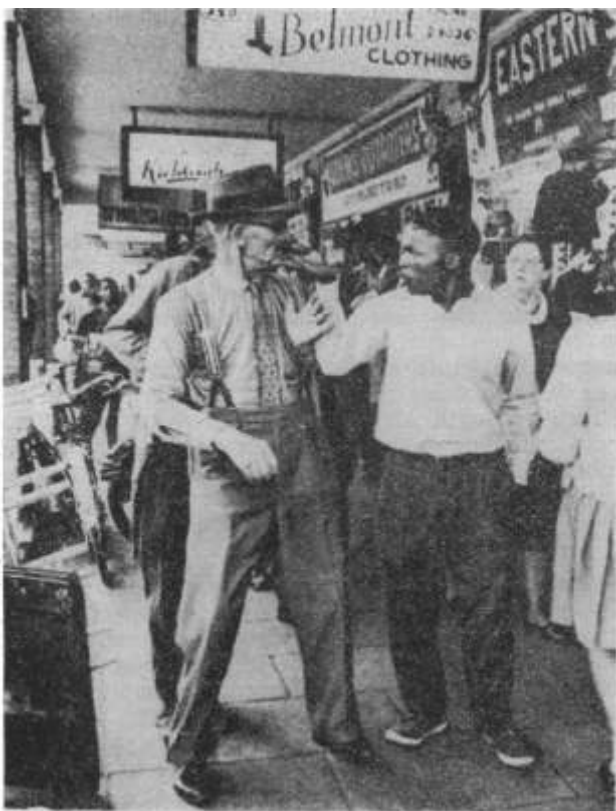
Tsotsis in action. A white pocket being picked. Whites are angered if touched by anyone black, but a black hand under the chin is enraging. This man, distracted by his fury, does not realise his back pocket is being rifled.

Tsotsitaal was first observed in Johannesburg in the 1940s (Glaser 2000: 50). The second syllable, taal, means 'language' in Afrikaans, and the full word Tsotsitaal simply means 'Tsotsi language'. A well grounded account for the emergence of the term tsotsi is that of Clive Glaser in his book Bo-Tsotsi (2000), who shows that it was first coined around 1943–44 in reference to a particular group of urban youths (Glaser 2000: 50). Tsotsis were both a result of, and a justification for, apartheid policies of segregation.