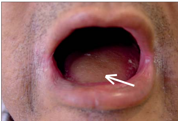
Fig. 2. Convex floor of mouth reconstructed with pectoralis major flap (white arrow).

Upwardly convex floor of mouth (FOM). The reconstructed FOM must be upwardly convex in order to prevent saliva and food pooling in the mouth, and to facilitate oral transport and speech (Fig. 2). This requires a bulky musculocutaneous flap such as latissimus dorsi and pectoralis major pedicled flaps, or anterolateral thigh or rectus abdominis free flaps. As the muscle of the flap will atrophy, the flap must appear too bulky at the time it is inserted. A fasciocutaneous flap such as an RFFF does not provide adequate bulk. Doing a complete marginal mandibulectomy and suturing the flap to the gingivobuccal mucosa obliterates the lateral sulci in the mouth, and further