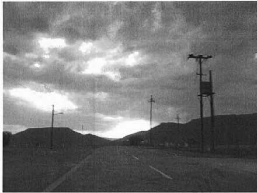
The road to Calvinia: April 2007

Travelling from Cape Town, one can reach Calvinia in two ways - either by taking a detour on tar, or else going there directly, via the gravel road. Although the gravel road is the more uncomfortable way, it drafts a mental map of the rough world beyond the mountains. The slow bumping ride makes the car creak dangerously. Stirred-up red dust finds its way through every hole until it eventually attacks the lungs. In the case of a breakdown, you have to hike through the mountains for help; there is no cell phone reception. It feels like driving on the moon. Civilisation behind the range of mountains seems unlikely. Every turn and every hill heightens the anticipation of the end of the road and the world, until unexpectedly the houses of Calvinia appear in the distance.