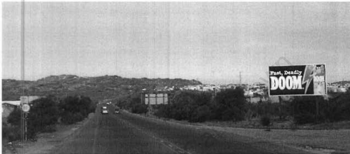
Baden-Powell Drive between Macassar Dunes Nature Reserve and Makhaza Township; April 2007

About a year ago, the only sign at the entrance of the Macassar Dunes Nature Reserve was a billboard advertising Doom anti-cockroach spray. Now, in January 2008, an official board announces Mother Nature's inimitable playground behind the hill. I can't help thinking that last year's slogan 'Fast, Deadly, Doom' was more appropriate for the reserve than 'Macassar Dunes Nature Reserve - an initiative of the City of Cape Town and the Macassar Dunes Co-Management Committee'.