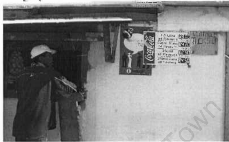
A local shop in Masiphumelele, March 2007

Masiphumelele. Masiphumelele is isiXhosa for "Success". A year after the attacks, she takes me on a tour through the township.