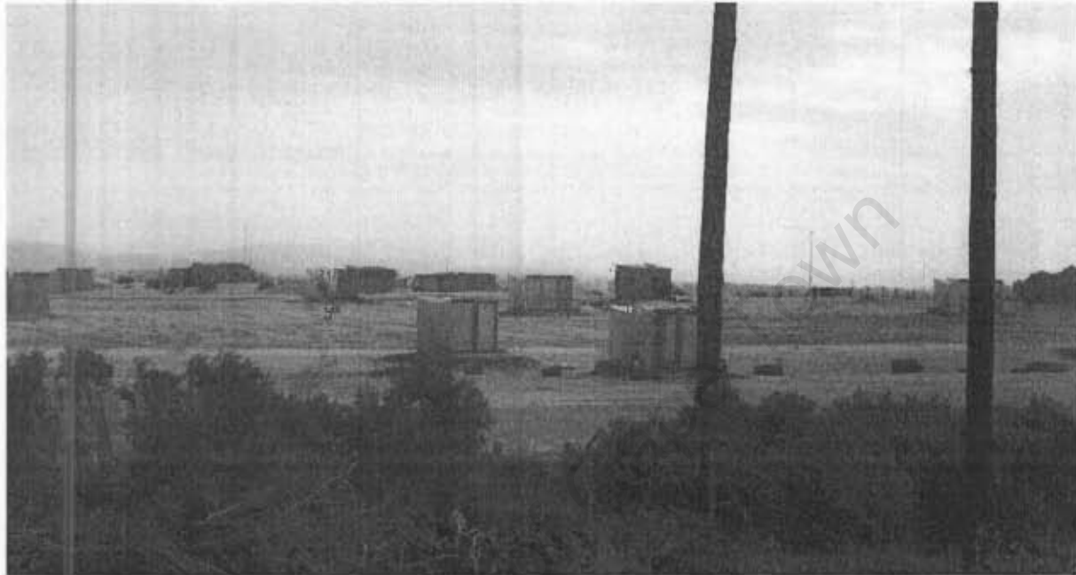
Khayelitsha; April 2007