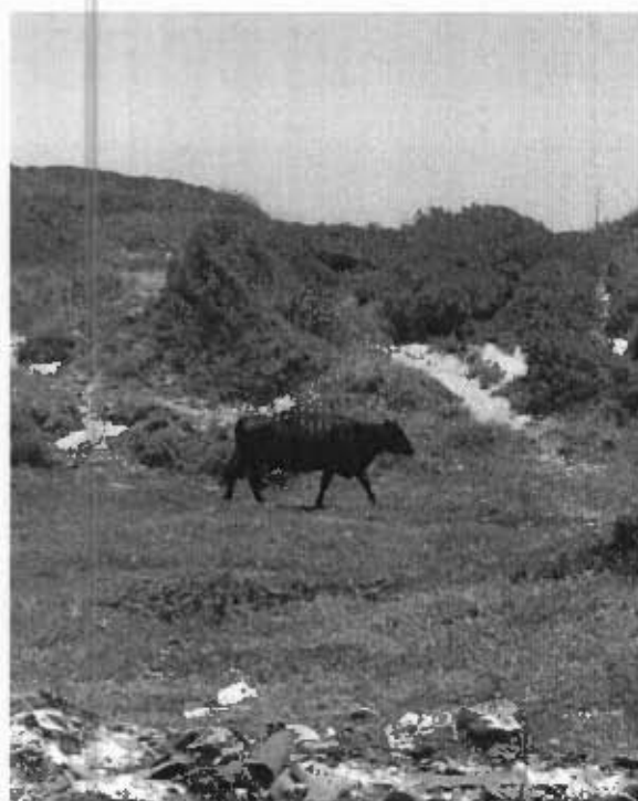
Grazing cattle close to the Eerste River Mouth; January 2008

The rangers have repeatedly called the city's waste removal department to clean up. 'They grew tired of coming out here,' Thumeka says.