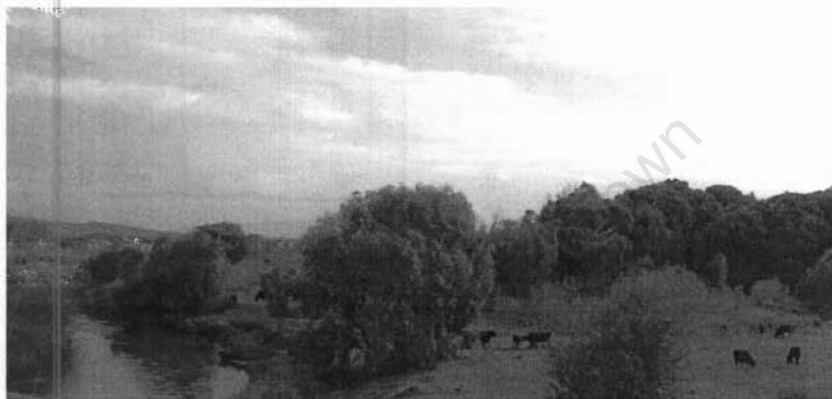
Macassar near the Kramat; May 2007

While I am driving further along Baden-Powell Drive from the resorts towards the Kramat, the scene reminds me of a romantic painting by JMW Turner. In the distance, soft hills swell in misty clouds. The Ferste River curls through lush meadows, where spotted cows peacefully graze between old farmhouses. However, the chances of finding anything living in the river are slim, due to illegal waste dumping.