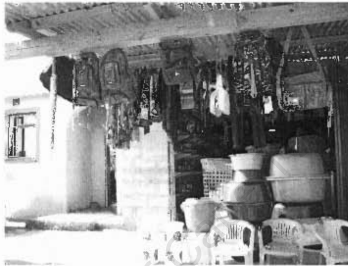
A Somali township shop in Masiphumelele, March 2007

Somali refugees don't foresee the chance of returning to their home country any time soon and they build an existence in South Africa with the intention to stay. The landless strive to obtain economic independence through trading.