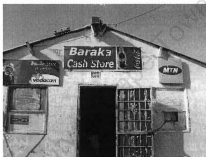
'Baraka's shop' in Masiphumelele, March 2007

Almost a year after the attacks, there are no visible traces of the former destruction. To Charlotte it looks like before. 'The shops are all rebuilt. Some of the Somalians are back again and some of them are not. Everything is now back to normal.'