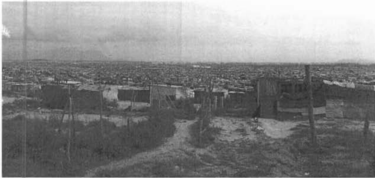
Khayelitsha: April 2007

population lives here. The township, the result of poor urban apartheid planning, lacks all sorts of essential amenities and infrastructures.