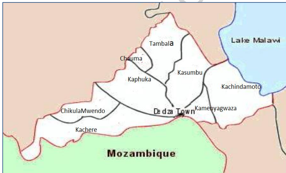
Figure 2.2: Map of Dedza district ( District Social Economic Profile, 2013)

Dedza district is 85 kilometres south of Lilongwe, the capital city of Malawi. The Chewa is the most dominant tribe, followed by the Yao. Oral history suggests that the Chewa people were the first to occupy the area. They migrated from Uluba, in the present Democratic Republic of Congo, between the 14 th and 16 th centuries and settled in various places in Malawi (Phiri, 1997:22-23). There are 20 896 inhabitants, organised in 310 villages, under 24 group village headmen in the area (Malawi National Statistics Office, 2008). TA Chauma 48 is one of the eight government-recognised high-level traditional leaders – mfumu yayikulu – in Dedza district. The area borders Tambala and Kaphuka Traditional Authorities. Figure 2.2 below, is a map of Dedza district.