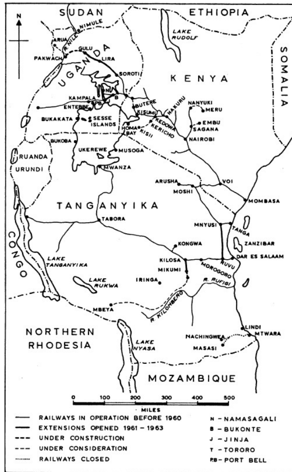
Railways in East Africa, 1963.

In addition, Table 1 provides a snapshot of the relative size and importance of the East African Railway Corporation (EARC).