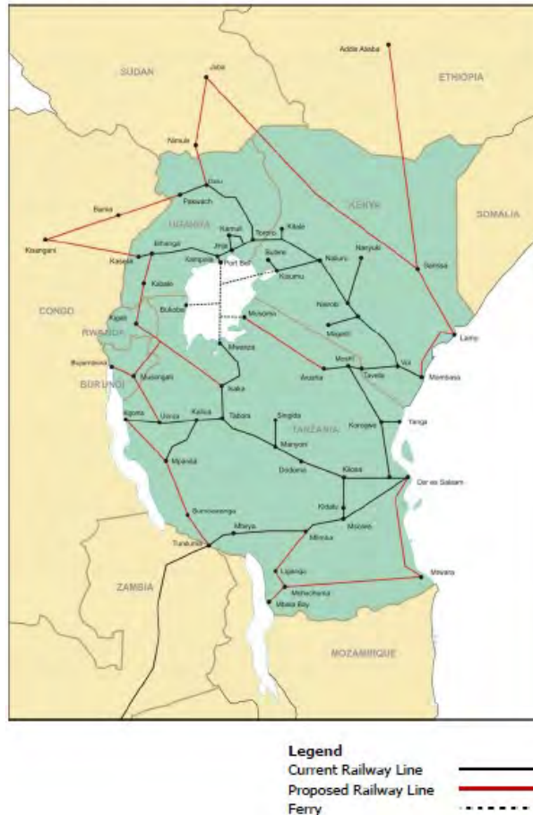
EAC Current Network with Proposed New Lines