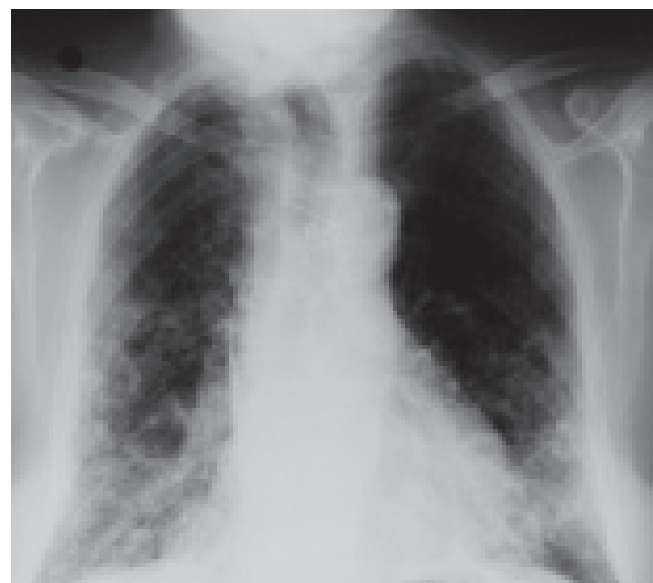
Fig. 1. Above: chest radiograph taken in 1996, showing cardiomegaly and old asbestos plaque. Below: the current film, showing cardiomegaly and interstitial changes mainly at the bases with no signs of cardiac failure.