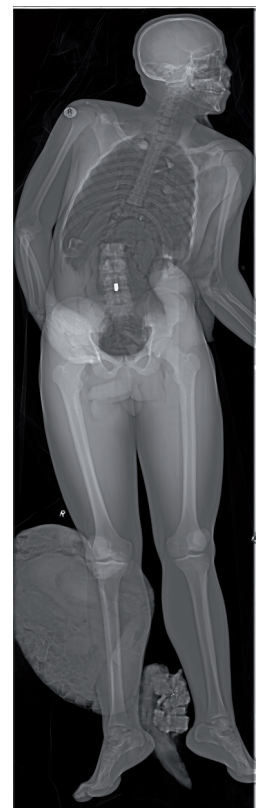
Fig. 3 (right). Firearm fatality with single bullet wound in the chest. The lower thoracic vertebrae were removed at autopsy in a failed search for the bullet. A Lodox scan revealed that the bullet had lodged in the lumbar vertebrae.