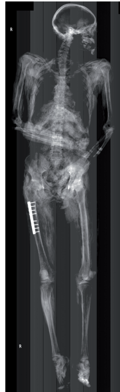
Fig. 1 (left). Decomposed body on which some identification had been found. Cause of death undetermined. A Lodox scan revealed no bullets, but plate and screws in the right upper femur confirmed identification.

The Statscan/Lodox system has clearly demonstrated the following advantages in a medico-legal unit.