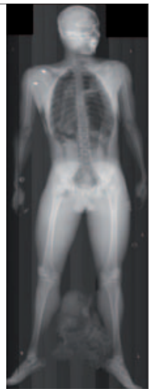
Fig. 2. Firearm fatality, multiple bullet wounds with difficulty in establishing entrance and exit wounds and defects (see sketch). Corresponding wound tracks were therefore difficult to establish. Retained bullets were suspected, but a Lodox scan revealed only two, in the right shoulder.