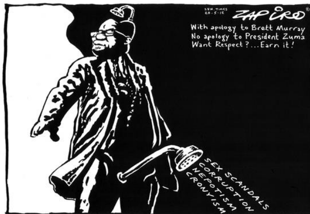
Fig.4: source: www.okafrica.com

Through his cartoon, Zapiro contends that, contrary to what the president and his supporters felt about the attack on his dignity and disrespect thereof, respect – is earned not deserved. Further to this says a blurb on the caricature: “Sex scandals, corruption, nepotism and cronyism” (Zapiro, 2012) all of which are issues the president has been reported to have been involved in, do not make him [Zuma] one who deserves respect, Figure 4.