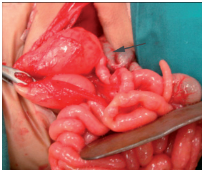
Fig. 2. Situs inversus of stomach with duodenal atresia (arrow).

The colon was mobilised and the duodenal atretic segment exposed. A routine diamond-shaped duodeno-duodenostomy was performed. Postoperatively the baby was kept on