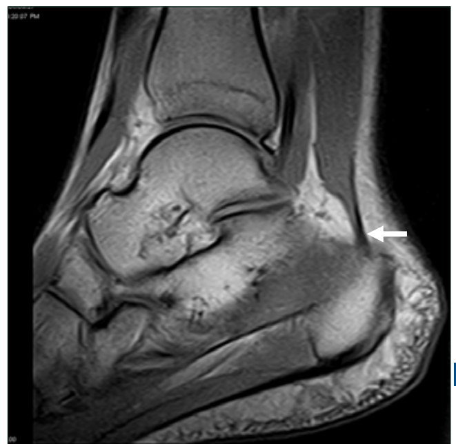
Fig. 2. Left ankle MRI: posteromedial insertion (arrow) of the accessory soleus muscle onto the calcaneus via a thin tendon.