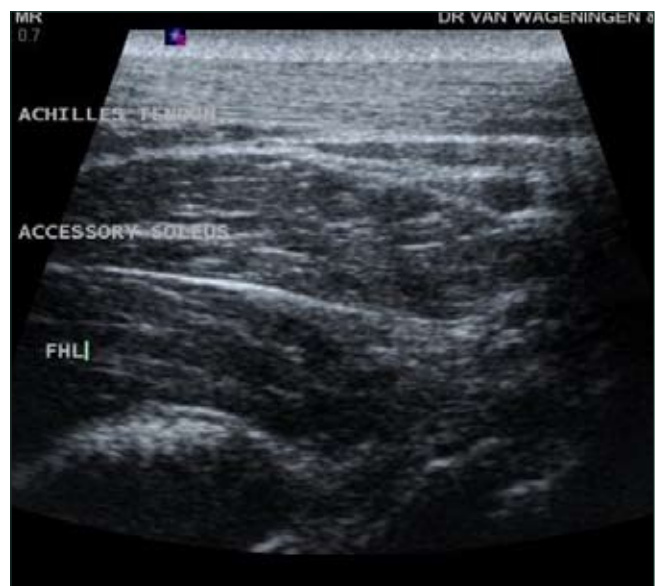
Fig. 1. Ultrasound of left accessory soleus muscle: same echogenicity and appearance as the underlying flexor hallucis longus muscle.

Corresponding author: EW Derman ( wayne.derman@uct.ac.za )