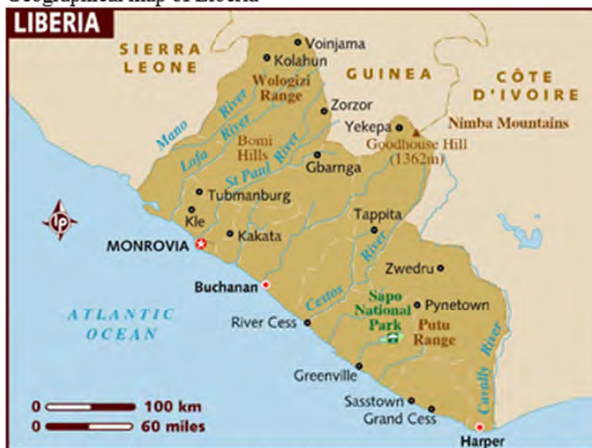
Geographical map of Liberia

http://www1.international.ucla.edu/media/images/wg-liberia-2060-400x300.gif (accessed 03 July 2014)