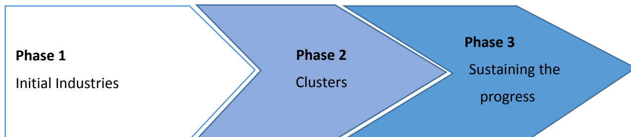
Figure 2: The focus of the three phases of economic prosperity.

meet national goals such as the reduction of poverty and inequality. 97 There are three phases that a country goes through to reach economic prosperity. 98 These phases can be distinguished by their focal points, namely: initial industries, clusters and sustaining the progress and this is represented in the diagram below.