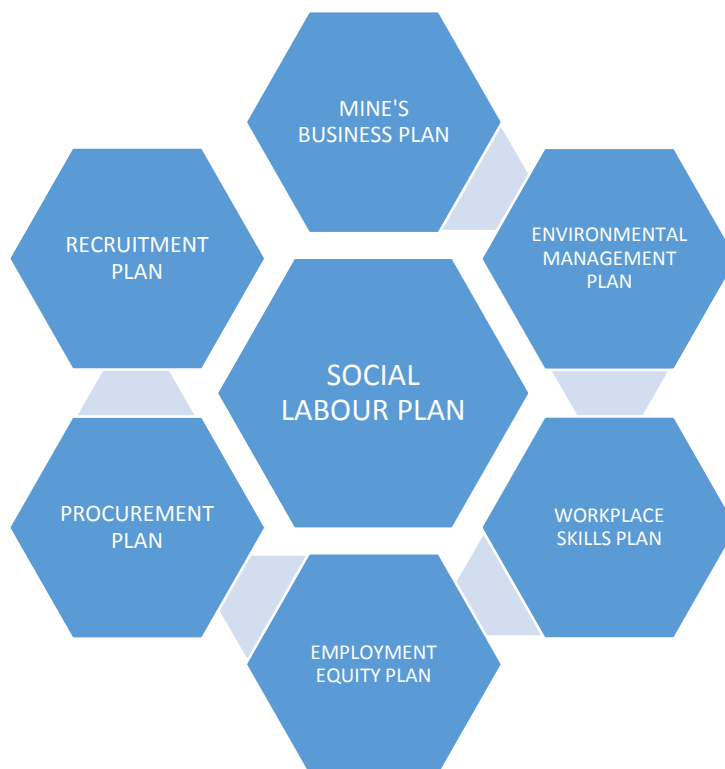
Figure 4: Mining operation plans that should inform the design of SLPs. 237

SLPs typically target the specific areas surrounding their mining operations (enclaves) to contribute to those areas' socio-economic development. 238 This enclave approach to socio-economic development is prone to critique. From this critique, a premise of this dissertation arises, namely that not even absolute compliance with the SLP System 239 can result in large-scale and far-reaching socio-economic development of South Africa. 240 As such, the SLP System misses one of its central aims.