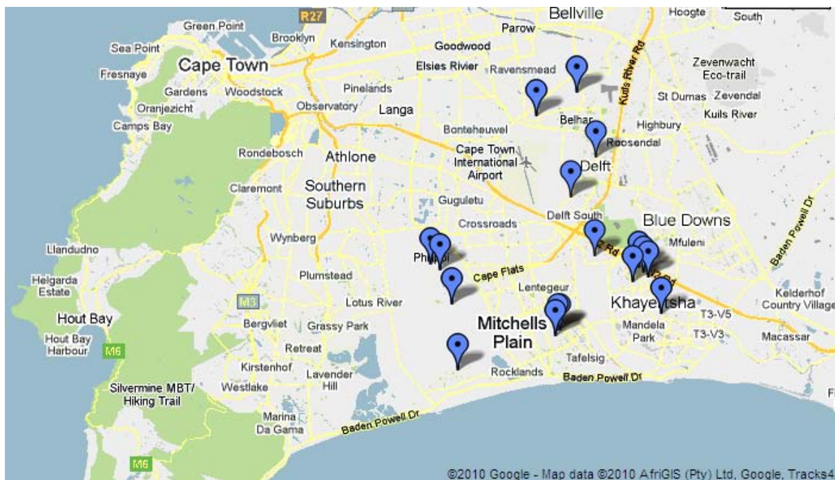
Figure 3.1: General areas of Residence for Sample Group