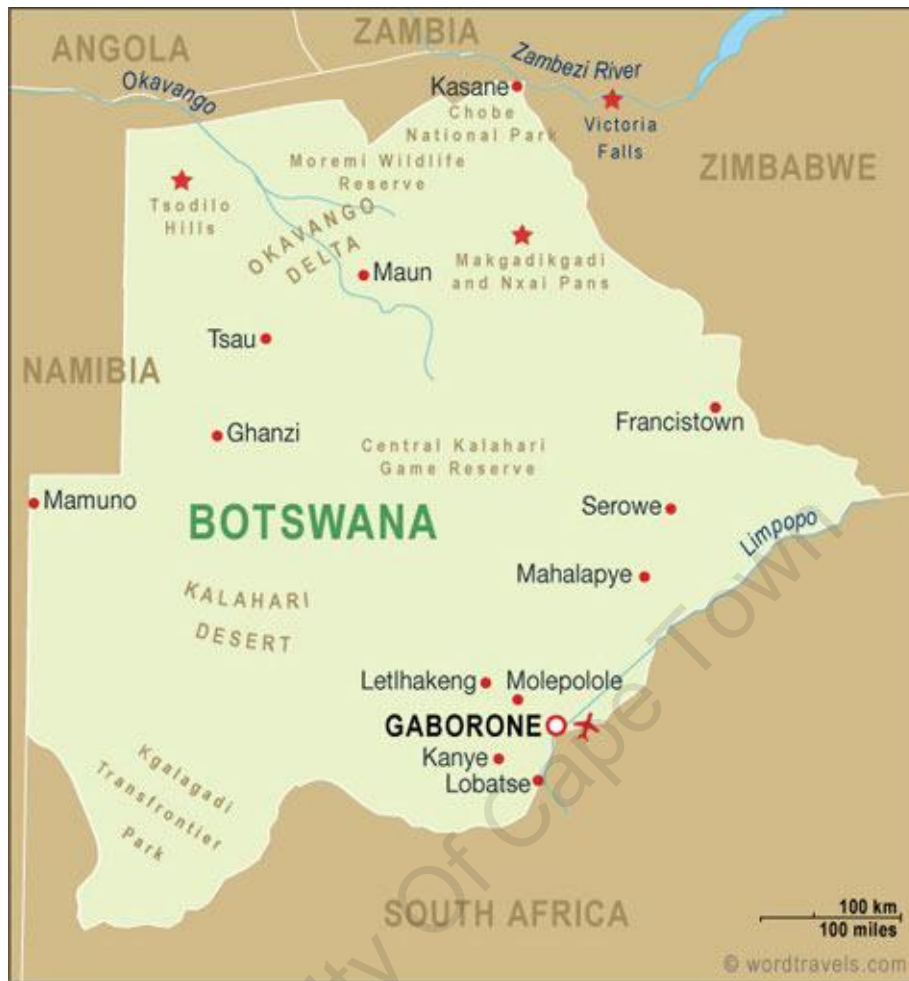
Figure 1: Botswana Map

Botswana was one of the poorest countries in the world at independence in 1966, but is now classified as a middle-income country. Despite this classification, poverty is still one of the major challenges facing the country. According to Lindsay et al, (2003) 47 percent of the population live below the poverty datum line of US$1.00 per day. Poverty is concentrated in the rural areas especially Kgalagadi and Ghanzi districts where most people depend on social welfare. Like most developing countries, poverty in Botswana has a gender bias; female-headed households are the most vulnerable. Because of the high levels of poverty, many households have difficulties in meeting their basic needs such as food, clothing and shelter (UNDP, 2000; Lindsay, et al, 2003; Republic of Botswana, 2003a; Siphambe, 2003).