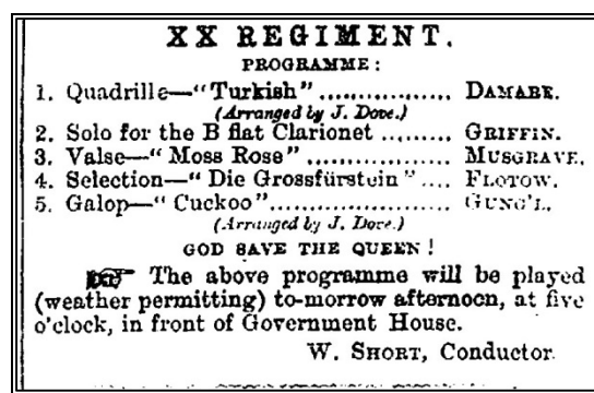
Figure 7, Natal Witness advertisement for 6 March 1869 20 th Regiment Band concert 105

The second concert involving the clarinet was on 6 March 1869; the programme was: