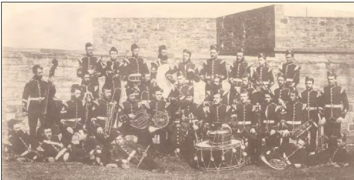
Figure 5, Photo: 1879zuluwar.com, “The band of the 1/24th Regiment of Foot” (accessed 9 November 2015)