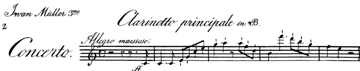
Figure 3, from the solo clarinet part of Iwan Müller’s Concerto no.3 . 27

This could be due to the “I” and “J” being very similar in cursive script; Müller’s first name on the parts of this same edition is given as: