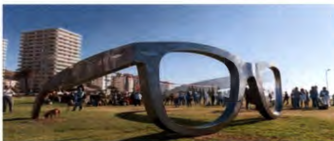
The Bullshit Files: The "Mandela" Ray Ban "Sculpture" in Cape Town