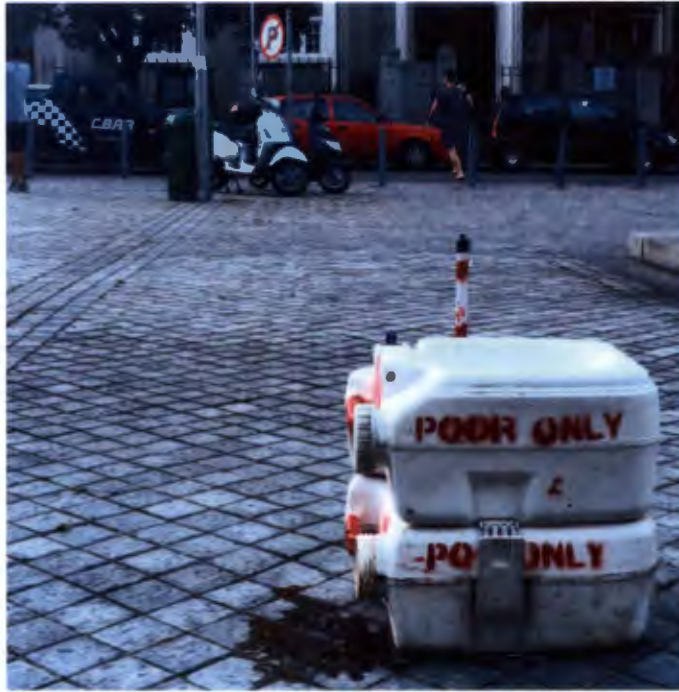
Figure 8: The Tokolos Stencil Collective, Poor Only , 2014. Public toilet installation. Church Square, Cape Town. (Tokolos-Stencils 2015).

When questioned why they did not just refuse the invitation to participate, Tokolos replied by saying that through their participation, they exposed some of the hypocrisies of the art world. They elaborate on this statement by explaining the different levels of their participation to Gedye (2014):