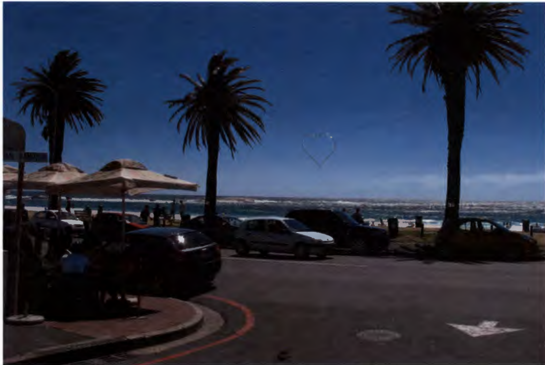
Figure 3: Michael Elion, I Love You! , 2012. Stainless steel, 101 faceted glass crystals, 200 x 200cm. Camps Bay Beachfront, Cape Town. (Michael Elion 2015).

Elion created the rainbow spectre through the use of a petrol-fueled pump with a very fine nozzle in order to create water droplets in a size that would allow sunlight to refract off them. Elion describes this process as painstaking to get right, but definitely worth the effort when he sees people stopping and engaging with his works (Hunkin 2014)