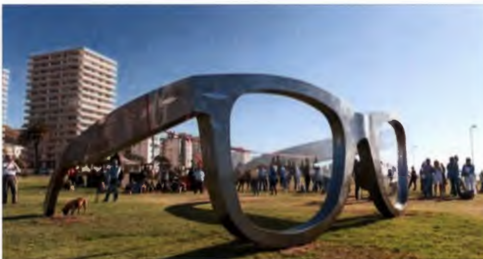
The Bullshit Files: The "Mandela" Ray Ban "Sculpture" in Cape Town