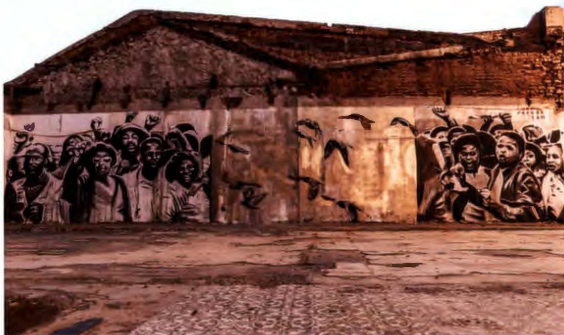
Figure 24: Freddy Sam, Freedom Day Mural , 2014. Painted mural, Albert Road, Woodstock. (Freddy Sam 2015).

A combination of the word naaiers (heralded by Afrikaans rappers Die Antwoord —directly translating to ‘fuckers’ 4 ) and “gentri” short for gentrification 5 , is used to identify local businesses in the Woodstock Area that are contributing to its gentrification process. The Tokolos angrily observed this process and have set out to identify the businesses responsible. The Tokolos Stencil Collective (2015) berated the