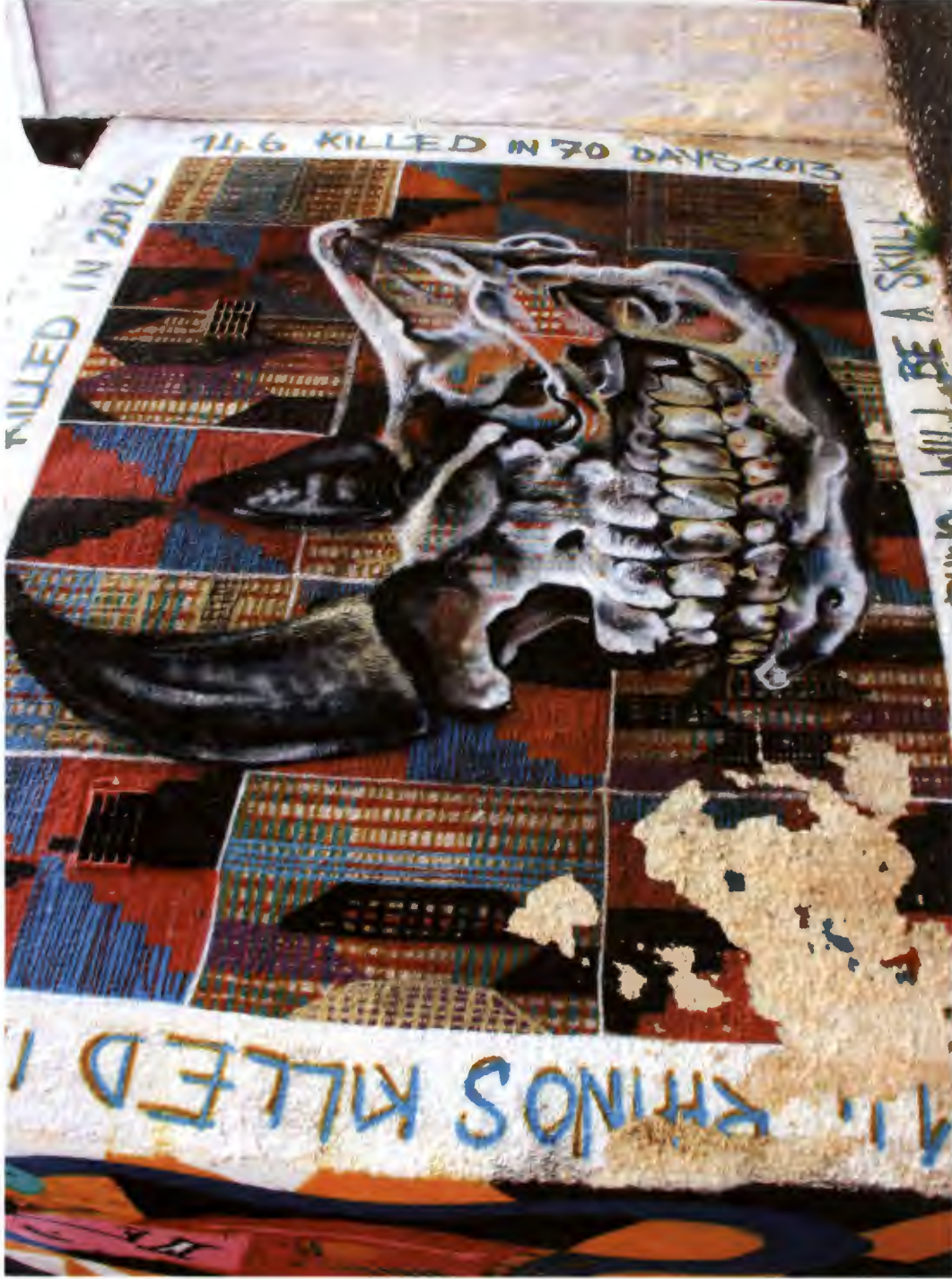
Save our Rhino part II (2012)