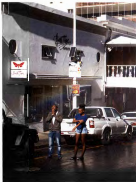
Figure 2: Michael Elion's Rainbow , Wale Street, Cape Town, 2012. Photograph by Bart Fouche. (Cape Town Magazine 2015).

Although Elion's oeuvre includes a large amount of pop art, large scale installations and statues in Paris, London, and Johannesburg, the scope of this research focusses particularly on Elion's work in Cape Town. Elion has a notable preoccupation with creating an aesthetically pleasing outside world that can correlate with an inner sense of harmony (Hunkin 2014). This is perhaps nowhere more evident than in his Rainbow (Figure 2) and heart ( I Love You! ) (Figure 3) public artworks.