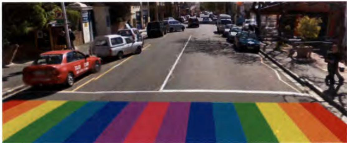
Figure 6: Designer unknown, Conceptual image for Rainbow Crossing . Kloof Street, Cape Town, 2014. (Cape Town Magazine 2015).

The last part of the project was Elion's hope to transform zebra (pedestrian) crossings in the city to rainbow or multicoloured ones. However, his aspirations have yet to be realized by the city council and as such, just remain conceptual drawings (Figure 6).