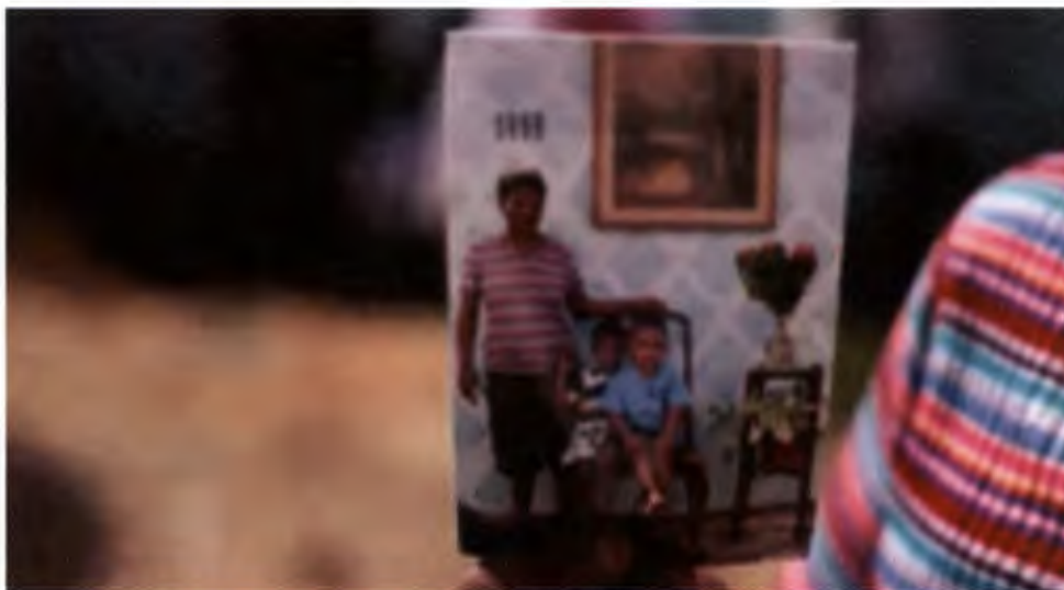
Figure 16: [close up of a portrait from Alexia Webster's Woodstock street studio], I Art Woodstock , 2011.

Webster and Saal created their first street studio with the I art Woodstock project. Their outdoor photographic studio was "similar to West African portrait photography tradition, where families can sit for portraits in a 'street studio' setting" (National Arts Council 2014). The photo was then produced on site for free with a portable photo printer, so that participants could take it home for their family albums (Artracker 2014). Examples of her work with this project can be seen in Figure 16.