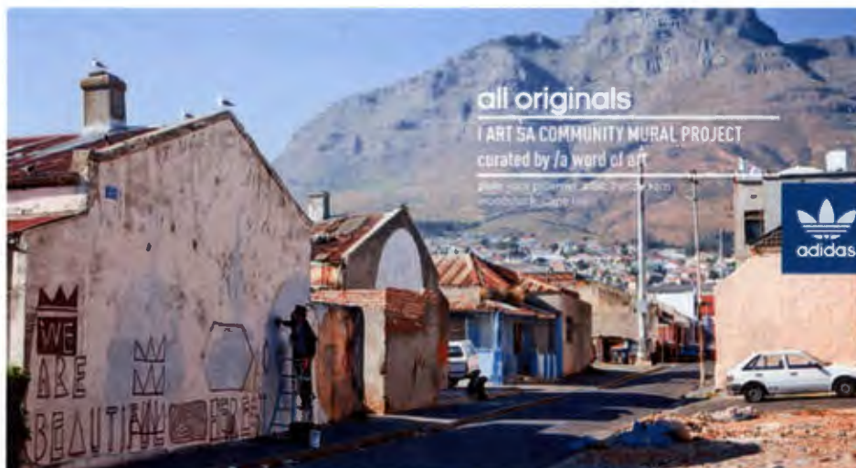
Figure 15: Designer unknown, [Title page of All Originals I Art SA Community mural project booklet]. (Graffiti South Africa 2013).