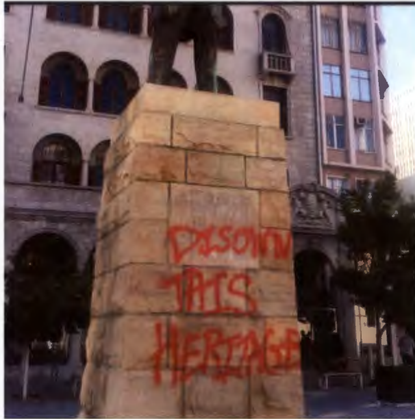
Figure 12: The Tokolos Stencil Collective, Disown This Heritage , 2014. Statue of Jan Hendrik Hofmeyr, (Onze Jan), Cape Town. (Tokolos-Stencils 2015).

Some of Tokolos' more recent anti-authoritarian statements include "Fuck Da Police", "This City Works For A Few", "Disown This Heritage" (Figure 12) and "EyeWie" (symbol for placement under CCTV cameras).