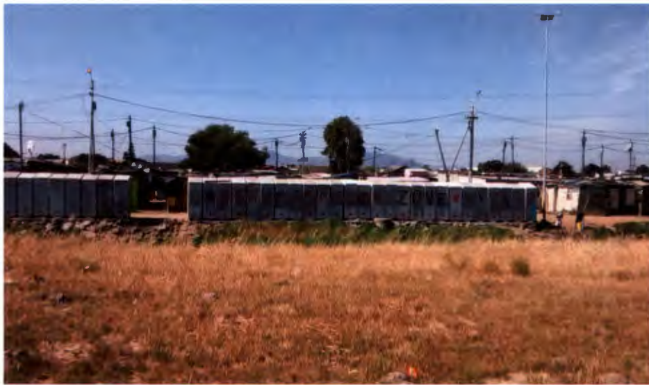
Figure 9: The Tokolos Stencil Collective, Dehumanisation Zone , 2014. Public toilets outside the Joe Slovo settlement alongside the N2 Highway, Cape Town. (Tokolos-Stencils 2015).

well as against several government institutions such as the Groote Schuur hospital and The University of Cape Town.