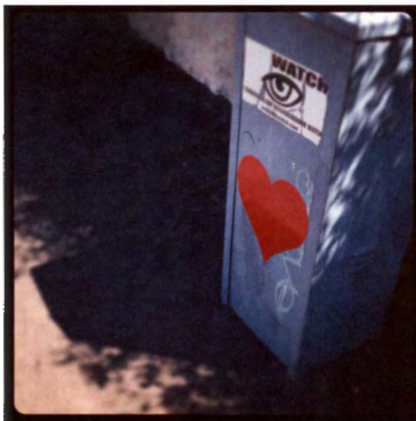
Figure 5: The Secret Love Project, heart sticker. Kloof Street, Cape Town, 2014.

Elion's aim was to distribute a simple shape that is universally understood, throughout the City of Cape Town (Figure 5). This in turn should lead to more positive thought processes which would hopefully lead to positive actions. On the Secret Love Project website Elion draws a comparison between the negative feel created by use of swastikas and his intention of using the same repetition of a symbol but to yeild a positve outcome in collective visual consciuosness. The Secret Love Project made sure that cars, walls, street signs, businesses and pavements were adorned with an array of colour heart stickers.