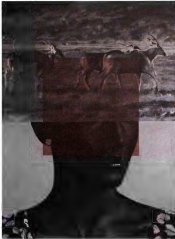
Figure 19: Ricky-Lee Gordon, Paradise is fading 1 , 2015. Oil on canvas, 150x200cm. (Freddy Sam 2015:1).