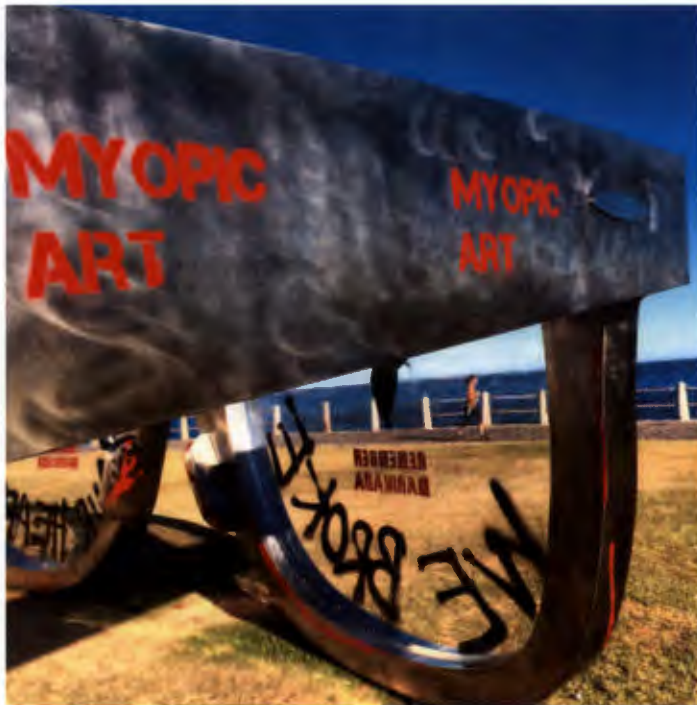
Figure 23: The Tokolos Stencil Collective, Improved version of Michael Elion's Perceiving Freedom , 2014. Sea Point Promenade, Cape Town. (Tokolos-Stencils).

The Tokolos' idea of improvement was a defacing of Elion's Perceiving Freedom (2014), with their trademark 'Remember Marikana' stencils and the words, 'Myopic Art' and 'We Broke Your Hearts' (Figure 23). However, regardless of what light the actions of The Tokolos collective are seen in, their wording is extremely significant. Young (2014a) points out that 'Myopic Art' refers to Elion's inward (or shortsighted) conceptualization of Mandela's legacy, without considering a broader public context or possible implications.