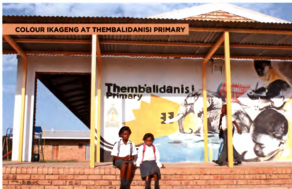
Figure 18: Colour Ikageng finished exterior. Thembalidanisi Primary School, Potchefstroom, 2014.