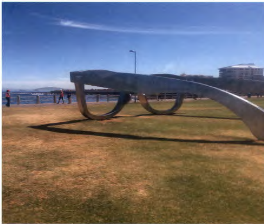
Figure 7: Michael Elion, Perceiving Freedom , 2014. Steel sculpture with polycarbon lenses (dimensions unknown).

In October 2014 Elion won a bid with the City of Cape Town's newly established public art board, Art54, to erect a public art sculpture. Although the location was originally supposed to be Camps Bay Beach, the sculpture appeared on the Sea Point Promenade in early November 2014. For the opening event, several government officials, World Design Capital spokespeople and members of the public gathered on Sea Point Promenade to unveil Cape Town's newest piece of public art, a larger-than-life pair of Ray-Ban glasses gazing out towards Robben Island (Figure 7).