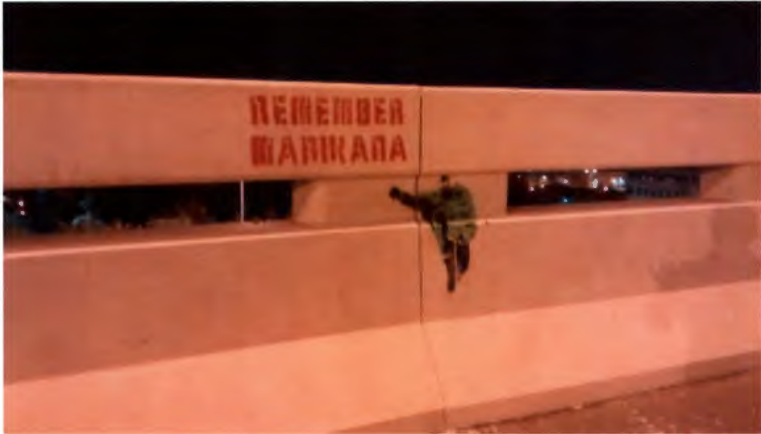
Figure 10: The Tokolos Stencil Collective, Remember Marikana stencil. Hospital Bend (the intersection on the N2 and M3 highways), Cape Town, 2014. (Tokolos-Stencils 2015).