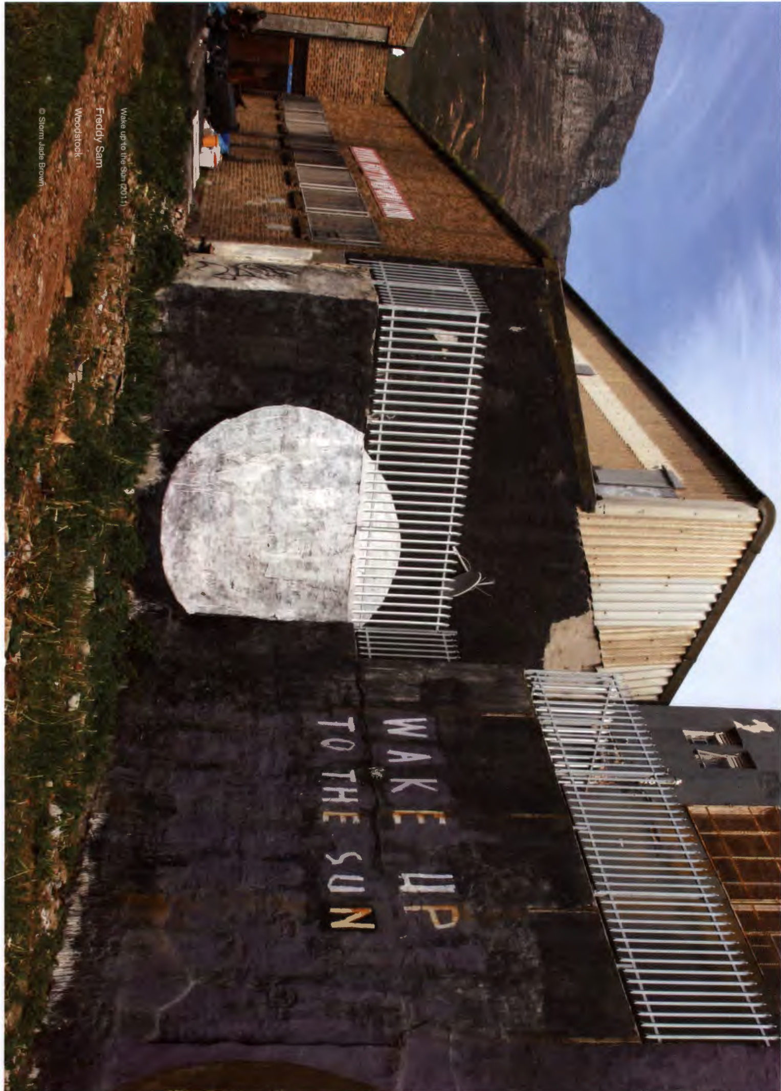
Wake up to the Sun (2011)