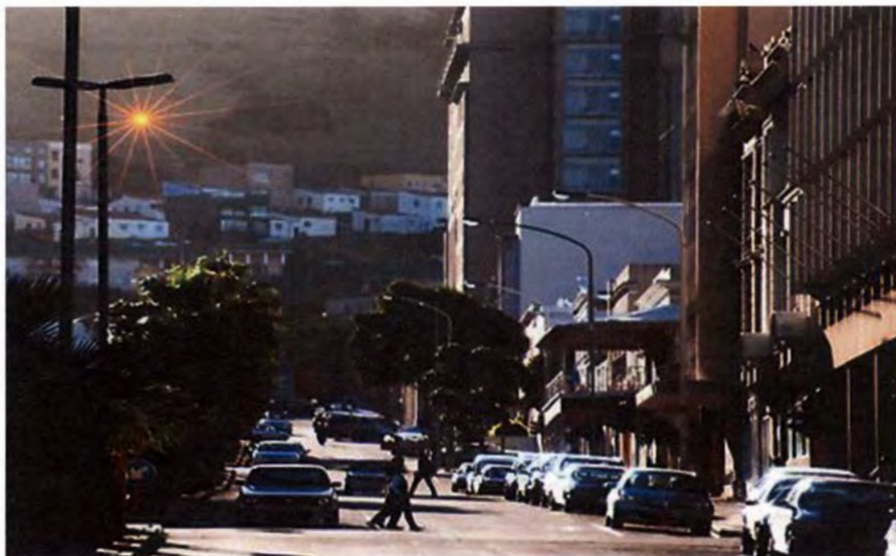
Figure 4: Sunlight catches hanging crystal as part of City of Rainbows Buitenkant Street, Cape Town, 2014 (Secret Love Project 2015).

The World Design Capital website (2014) describes the purpose of the City of Rainbows project as one that “aims to enhance the natural beauty of Cape Town by adding some magic and delight to everyday scenes, converting the urban landscape into a place of wonder”. Examples of Elion's crystals can be seen in Figure 4.