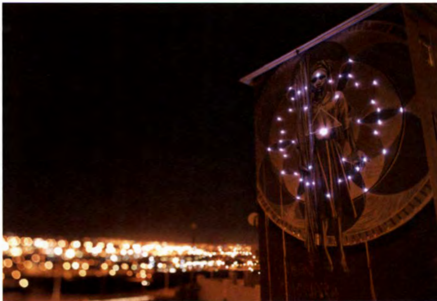
Figure 26: Faith47, The Harvest , 2014 Painted mural with electric light installation. De Waal Drive, Cape Town. (Faith47 2015).

The Harvest (2014) was conceptualized by Faith47 and is a collaboration with The World Design Capital and the #Anotherlightup project (Figure 26). The mural is painted against the side of one of the several houses on the outskirts of what was once District Six and infuses street art with the capacity of crowd funded community collaboration. According to the project description “[t]he multi-storey artwork has a visual feedback loop: the wall lights up at night each time enough money is raised for one new light to be installed on a pathway in the informal settlement of Monwabisi Park, Khayelitsha, through the organisation VPUU (Violence Prevention through Urban Upgrading)” (Anotherlightup 2015).