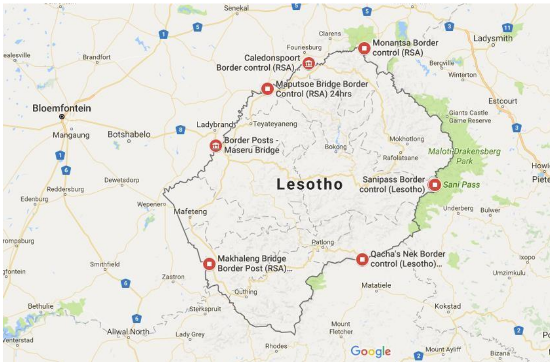
Figure 3: A map of Lesotho showing the border posts and proximity to Bloemfontein, South Africa