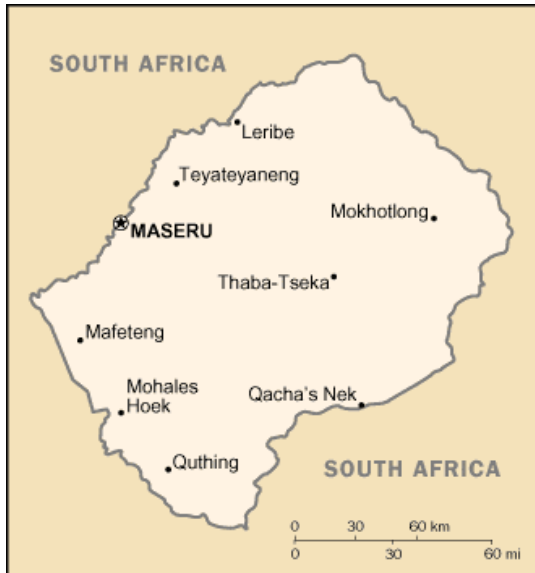
Figure 2: A map of Lesotho showing the main cities and towns