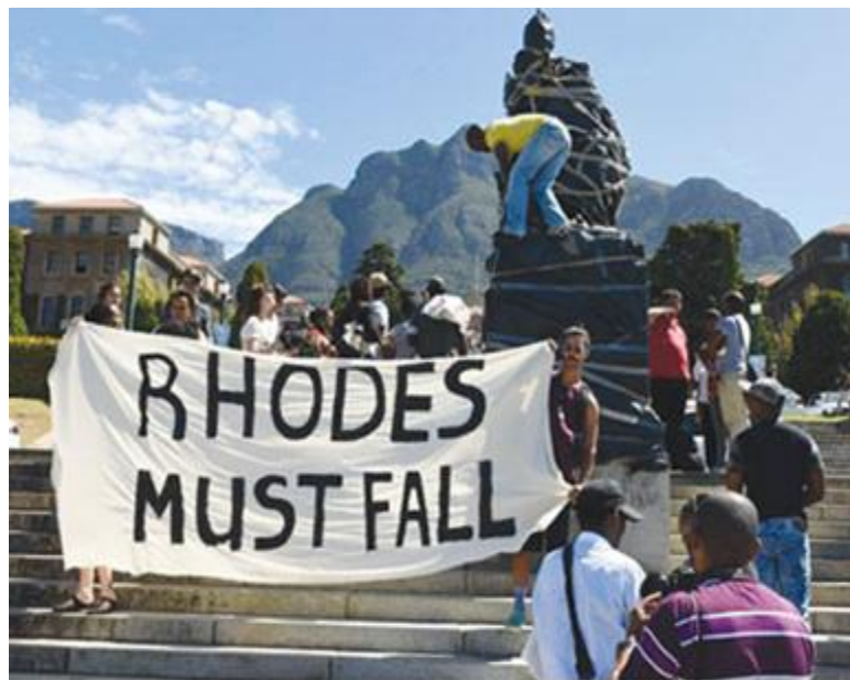
Cape Town U Must Fall protests

We visited Rice University and spoke with students about their perspectives on free textbooks. Check back tomorrow to see another student's perspective. #ForStudentsForever