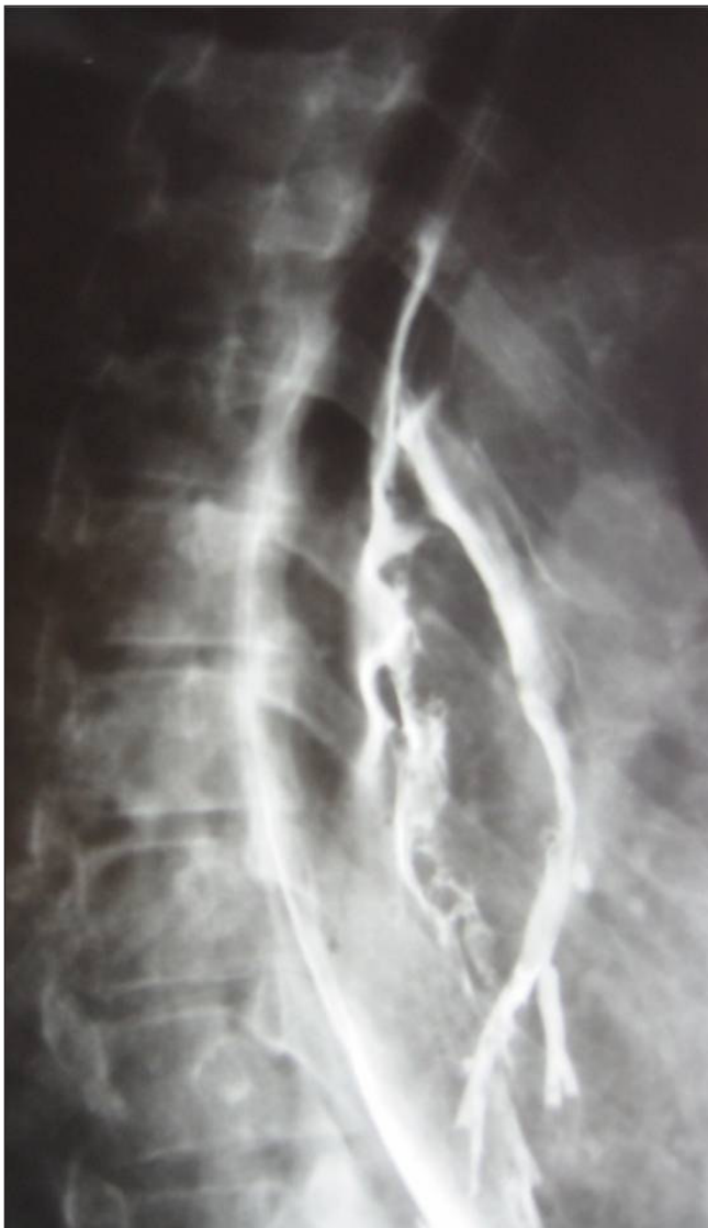
Fig. 1. Oesophago-bronchial fistula.

few patients were seen at a tertiary referral gastrointestinal unit, which could be explained by poor referral practices. The latter seems unlikely as we have an open-access endoscopy policy for HIV-infected patients and good community networks. Our study confirms that oesophageal ulceration occurs in patients with severe immunosuppression where 81% of patients had a CD4 count \leq 100 cells/ \mu\text{l} . South African HIV-positive patients may succumb to TB and other opportunistic infections before achieving this degree of immunosuppression.