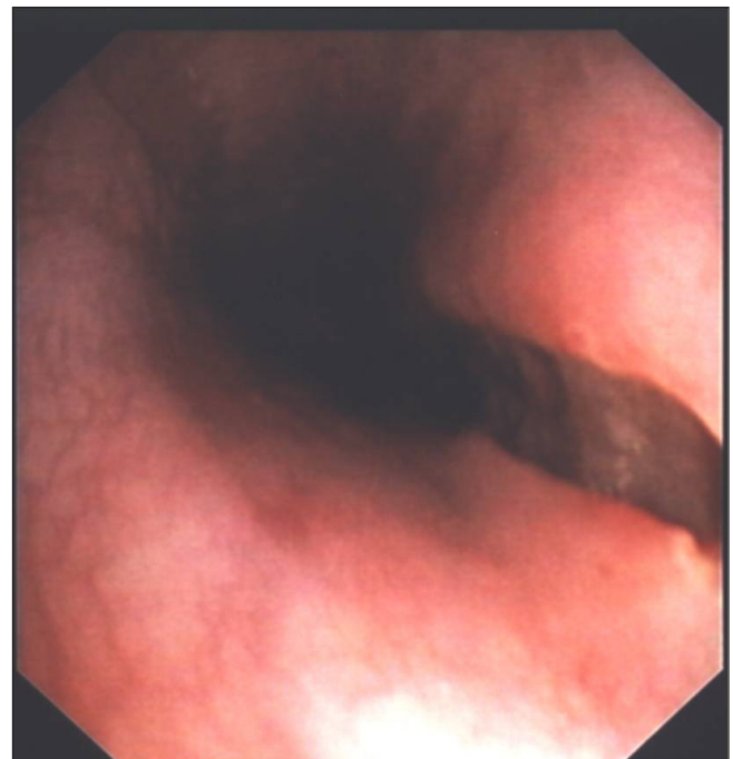
Fig. 2. Idiopathic oesophageal ulcer.