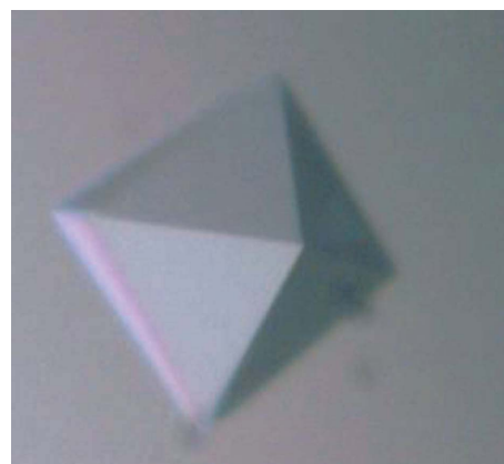
Figure 2 A crystal of the amidase from G. pallidus RAPc8.

X-ray diffraction data were collected using a Rigaku RUH3R copper rotating-anode X-ray source operated at 40 kV and 22 mA, a Rigaku R-AXIS IV + image-plate camera, an X-stream 2000 low-temperature system and an AXCO PX50 glass capillary optic with a 0.1 mm focus. Data from crystals mounted on a cryoloop (Hampton Research) were collected at a temperature of 100 K with a crystal-to-detector distance of 157.1 mm. Data frames covering an oscillation angle of 0.5° per frame and spanning a range of 48° were collected for