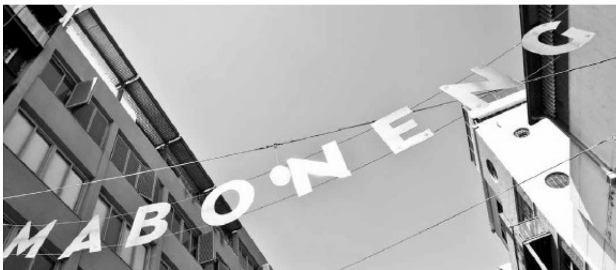
Figure 5: Place branded of Maboneng on Kruger Street in Maboneng