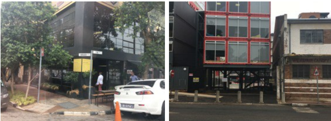
Figure 4: Examples of bulk addition to original buildings in Maboneng (maintaining the charm of the old with new modern additions of glass and steel)