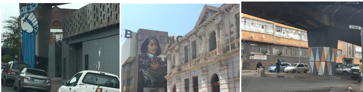
Figure 9: Examples of public art in Maboneng.

Over and above the buildings that have been developed, Propertuity currently has over 50 commissioned murals and/or art installations throughout the neighbourhood (Propertuity, 2016), most of which are painted onto the facades of buildings that Propertuity owns, which are described as ‘public art’ in Table 3 and shown in photographs in Figure 9.