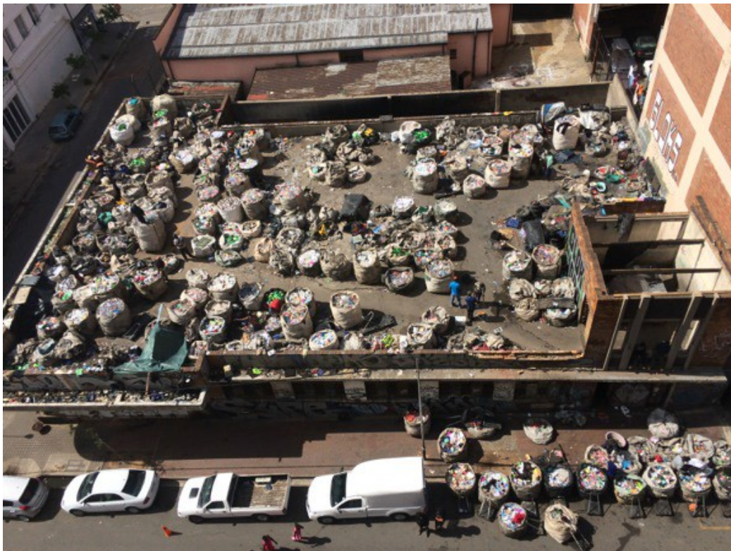
Figure 13: Waste collectors consolidate their waste in a high-jacked 'bad' building on Fox Street (image taken from Situation

As mentioned in the research methodology section, the data provided by Propertuity does not speak to the rest of the neighbourhood and what kind of communities shares space in Maboneng. In order to illustrate an extreme contrast of a Propertuity development, so some of the rougher neglected buildings in the neighbourhood, a photograph was taken from Situation East, a Propertuity development at the top of Fox Street (see Figure 13, p 68), which illustrates the stark contrasts between new Maboneng developments and the conditions of neighbouring buildings where waste pickers use dilapidated buildings to run informal collective waste collection.