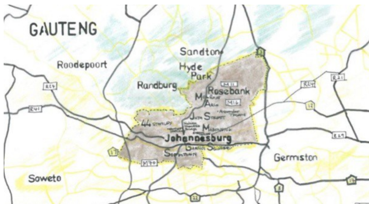
Figure 2: City of Johannesburg map outlining key neighbourhoods and developments in the city's history (by author)

Bremner (2000) argues that the "new security aesthetic" of post-apartheid Johannesburg reinforces segregation through a "multiplicity of worlds in a divided city." Therefore, from the leafy gated suburbs to the destitute sprawling informal settlements, from the glittering new central business district of Sandton to the decaying heart of Johannesburg's CBD - Johannesburg is known as a city divided (Dirsuweit, 2002).