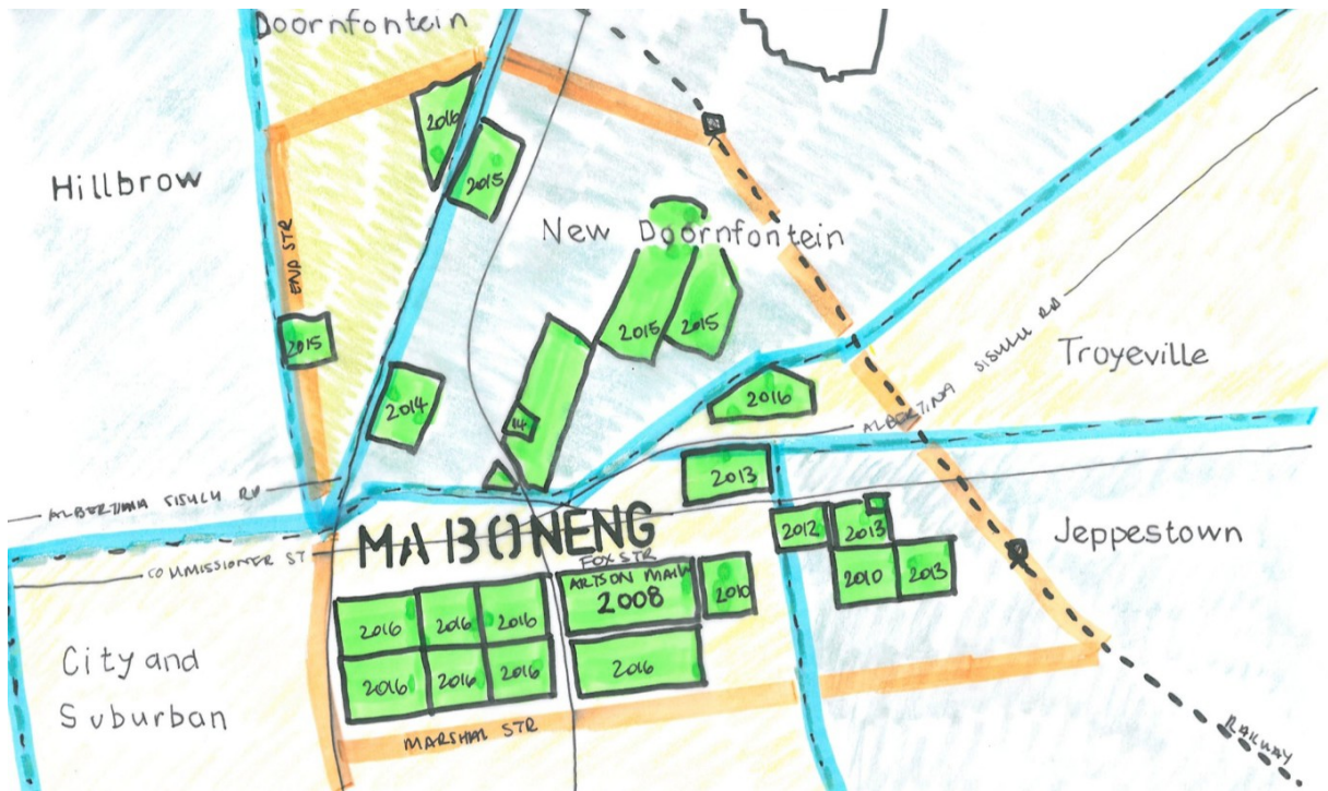
Figure 8: Spatial clustering of Maboneng Developments over time (Propertytuity, 2016; Daffonchio and Associate Architects, 2017)

The data in Figure 4 (page 34) and Figure 8 (page 60) illustrate on a map how Maboneng developments such as Arts on Main started in the suburb defined as 'City and Suburban' in 2008-2009, which contains low population density figures of 2,532 per km 2 . Since then, Propertytuity developments have expanded North East into Jeppestown (with population density figures of 8084 per km 2 ) and New Doornfontien (with even lower population density figures of 2,273 per km 2 ).