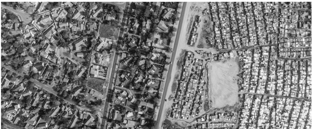
Figure 1: Aerial view highlighting the well-serviced properties of the middle class residential areas in stark contrast to the less-well-serviced townships in South Africa.