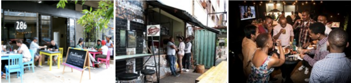
Figure 11: Maboneng has established itself as a food destination (Food 24, 2016). Images by author.

number of South African restaurants and cafés offering everything from pap and chops to sushi (Property, 2016).