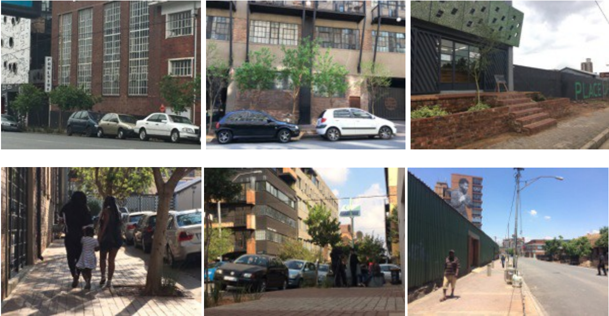
Figure 10: Photographs of sidewalk upgrades, tree planting and CID cleaning and security services in Maboneng.

Traffic-calming measures were taken by Propertuity to slow down the flow of traffic by turning two-lane roads into one-lane roads and creating more street parking for visitors. From 2009 to 2015, Propertuity created 516 new street (uncovered) parking bays and 54 new covered bays (see Figure 10).