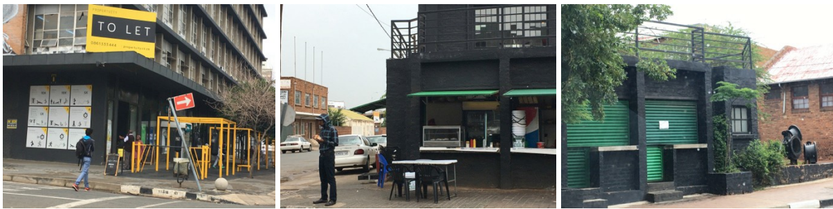
Figure 6: Photographs of Trim Park (left) and Common Ground Stalls (center and right).

Whilst the exterior of Common Ground has small-formalised vending stations that are street facing, catching the busy pedestrian footfall in the area. The stations were designed for previous ‘informal traders’ who provided pedestrians with on-the-go food and refreshments, thereby creating security of tenure for traders that now access electricity and can lock up their stores in the evenings. On weekends, the park sometimes becomes a small concert venue (Propertuity, 2016).