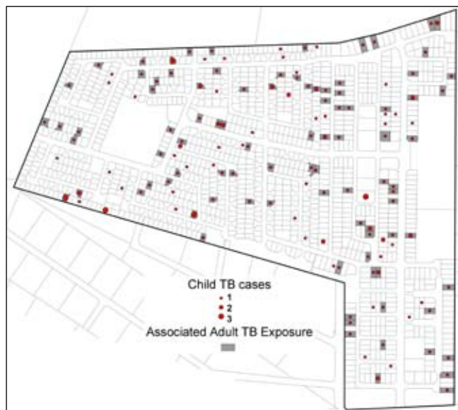
Fig. 1. Distribution of childhood TB cases and of notified adult TB cases from 1997 to 2007 in the community.

Overall 113 (66%) of the childhood TB patients had one or more exposures to a notified adult TB case on their residential plot during their lifetime, with an annual exposure rate of 33%. In 28% of cases a family name was shared with one of the adults notified on the plot. In total 105 children (61%) were exposed to adult PTB cases, 91 being exposed to a mean of 1.9 smear-positive PTB cases and 40 to smear-negative PTB cases (53% of all child TB cases v. 23%, p < 0.001 ). Fig. 1 shows the distribution of child TB cases and adult TB cases in the community. Children who were exposed to TB cases on their residential plot did not differ from those children not exposed in terms of age ( p = 0.23 ), gender ( p = 0.51 ) or HIV status ( p = 0.76 ). However, childhood TB cases not exposed on their residential plot were more likely to be retreatment TB cases than those exposed on the plot (12% v. 4%, p = 0.03 ).