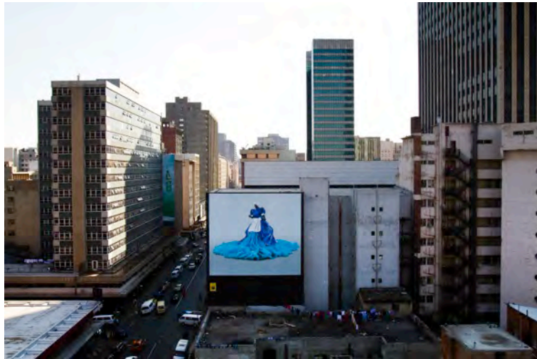
Fig. 2. Mary Sibande, Long Live the Dead Queen (2010). Artworks presented on nineteen buildings in the Johannesburg CBD.

Africa, Sibande opens up fresh possibilities for how this nation might imagine its collective future.