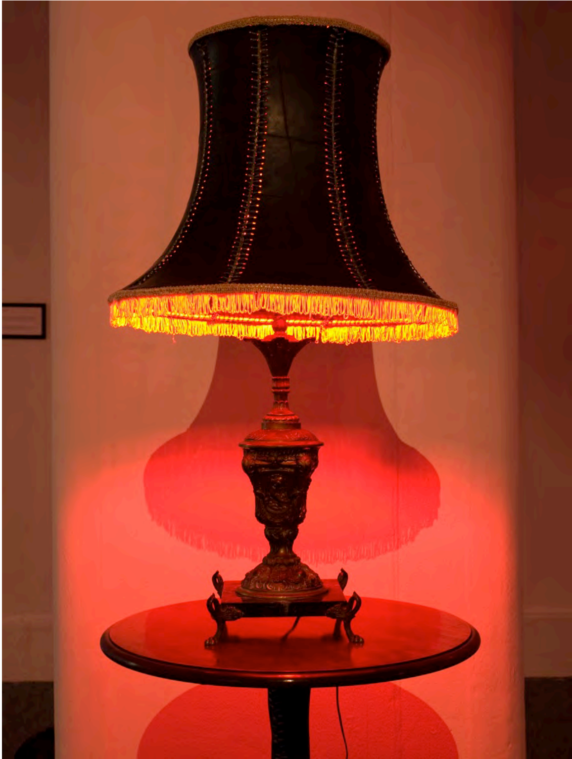
Fig. 3. Nicholas Hlobo, Kubomvu (2009). Found table, found lamp, rubber inner tube, ribbon, red light bulb. Installation view, Monument Gallery, Grahamstown.