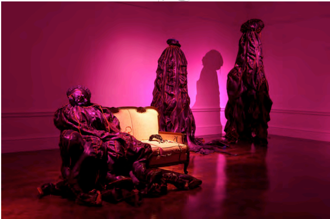
Fig. 4. Nicholas Hlobo, Izithunzi (2009). Rubber inner tube, ribbon, organza lace, found objects, steel, couch. Installation view, Iziko South African National Gallery, Cape Town.

Although postcolonial theory has accounted for the complex enmeshment of European and African values and the creation of transcultural forms with the contact zones of the public sphere, there is little to account for an equivalent entanglement in the realm of intimacy and sexuality. Rather than hankering after exhausted binary notions, which stem back to the nineteenth-century intensification of colonialism and reinstate cultural essentialisms in the present, Hlobo's figures articulate an embodied, physical sense of an entangled cultural inheritance. Bearing in mind the affirming theoretical valences around subjectivity and desire articulated by Pletcherová, Cvetkovich, Munro and Hoad, I argue that Umtshotsho affirms the radical social power inherent in the sensuousness of difference. His dark, lurking semi-human figures are so strikingly unlike any other figurative sculptures we've commonly encountered that they conjure new vocabularies of feeling. Rather than hankering after exhausted hand-me-down notions of cultural essentialism, the figures seem to connote an unknown and unfettered post-human future.