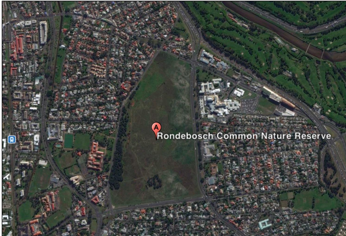
Figure 2. Aerial view of 2016 Rondebosch Common. Showing surrounding suburbs

The Rondebosch Common has been a valued fixture in the suburb of Rondebosch for over one hundred years with its recorded history beginning in the early nineteenth century when the area was a campsite for Batavian troops. After the British victory at the battle of Blaauwberg in 1806, the British troops established a camp on the site from 1807 to 1814. The Common was again used as a military campsite for a period during World War I, 1914 -1918. During the 1940s, the Rondebosch Common was once again commandeered by the military as a training camp and temporary structures were erected. In January of 1854 Charles Bell, the then Surveyor-General of Cape Town, made the case to the Governor at the time, George Cathcart, to donate the land that would come to be known as the Rondebosch Common to the Anglican Church of Cape Town (Eastman, 2008). The intention was for this land to be kept as open park land, open to the public and donating it to the Church seemed a good way of ensuring that. St Paul's Church had exclusive grazing rights to the land and charged rent to other farmers who wished to graze their cattle there as well. In 1890 a portion of the land, today known as Park Estate was sold to raise