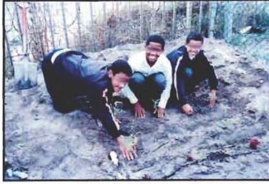
(Facing Up, 2003)