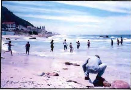
(Facing Up, 2003)