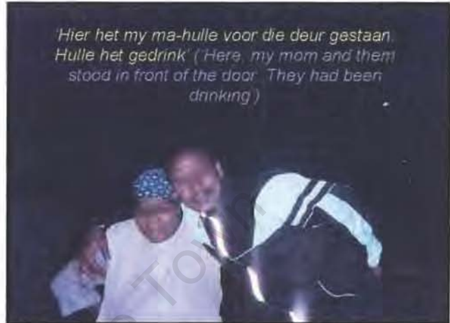
'Hier het my ma-hulle voor die deur gestaan. Hulle het gedrink' (Here, my mom and them stood in front of the door. They had been drinking)