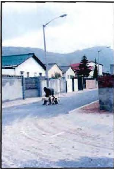
(Facing Up, 2003)