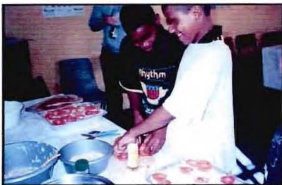
(Facing Up, 2004)