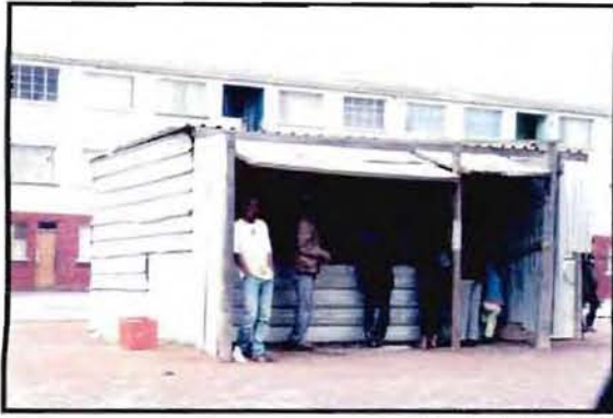
(Facing Up, 2003)