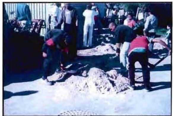
(Facing Up, 2004)