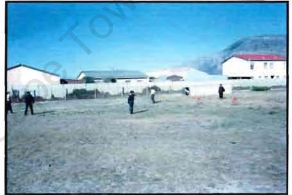
(Facing Up, 2004)