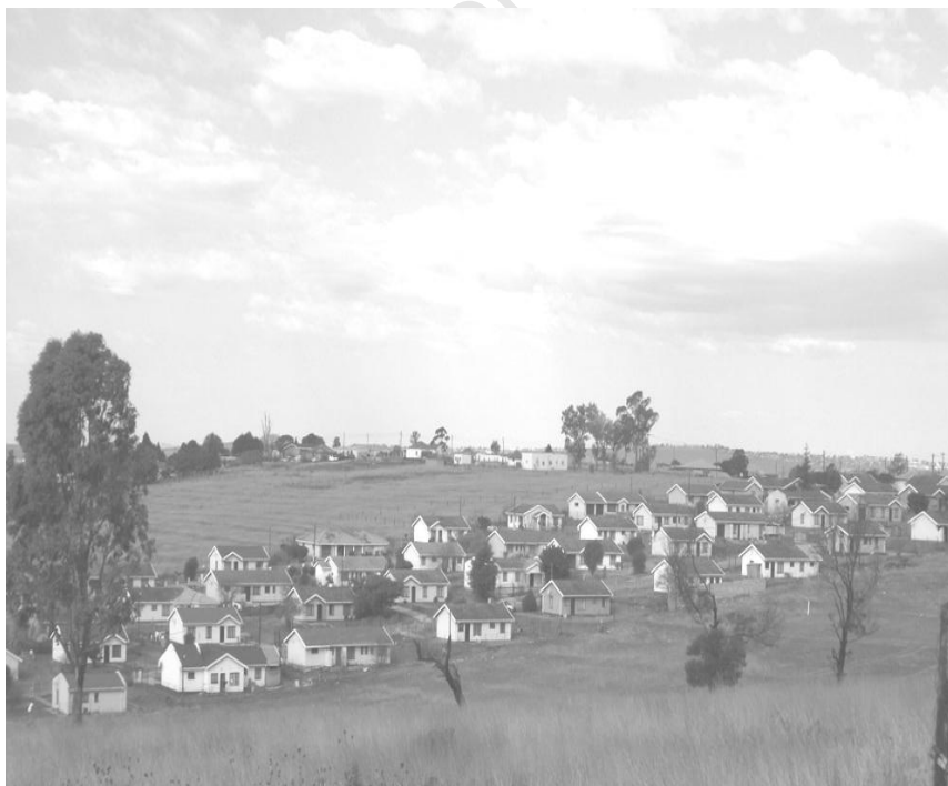
Figure 4. Phase one, Ncambedlana Extension.

Phase one was developed on the Matebese farm, phase two on the Mphako farm and phase three on the Qhinga farm. When construction on phase four was to begin, it was stalled because of infrastructural difficulties. It is alleged that the Mthatha municipality could not support the development due to inadequate sewerage infrastructure in the town. The remaining five farms remain inactive as they have already been sub-divided and are tied to the residential development. 121