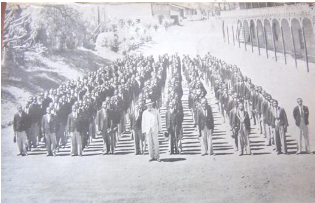
Figure 2. Students at Lovedale.

It is clear from the above account that the decision to embrace education by Elisha's 'red' elders represented a highly conscious decision, informed by the developments they saw unfolding. They anticipated the eventual colonial reign over the entire land and reasoned that it would be to their benefit to have one of their own schooled in the ways of the British colonial rulers. In the context of impending defeat, educated blacks such as Elisha were expected to provide leadership to their communities in negotiating their changed circumstances (see also Odendaal 1984, Gerhart 1978). Thus, Elisha's adoption by the Ndimas and his schooling in Tsomo was not only meant to satisfy their immediate parenting needs or Elisha's individual interests, but his 'red' elders ultimately anticipated the important role education would play for African nationalism.