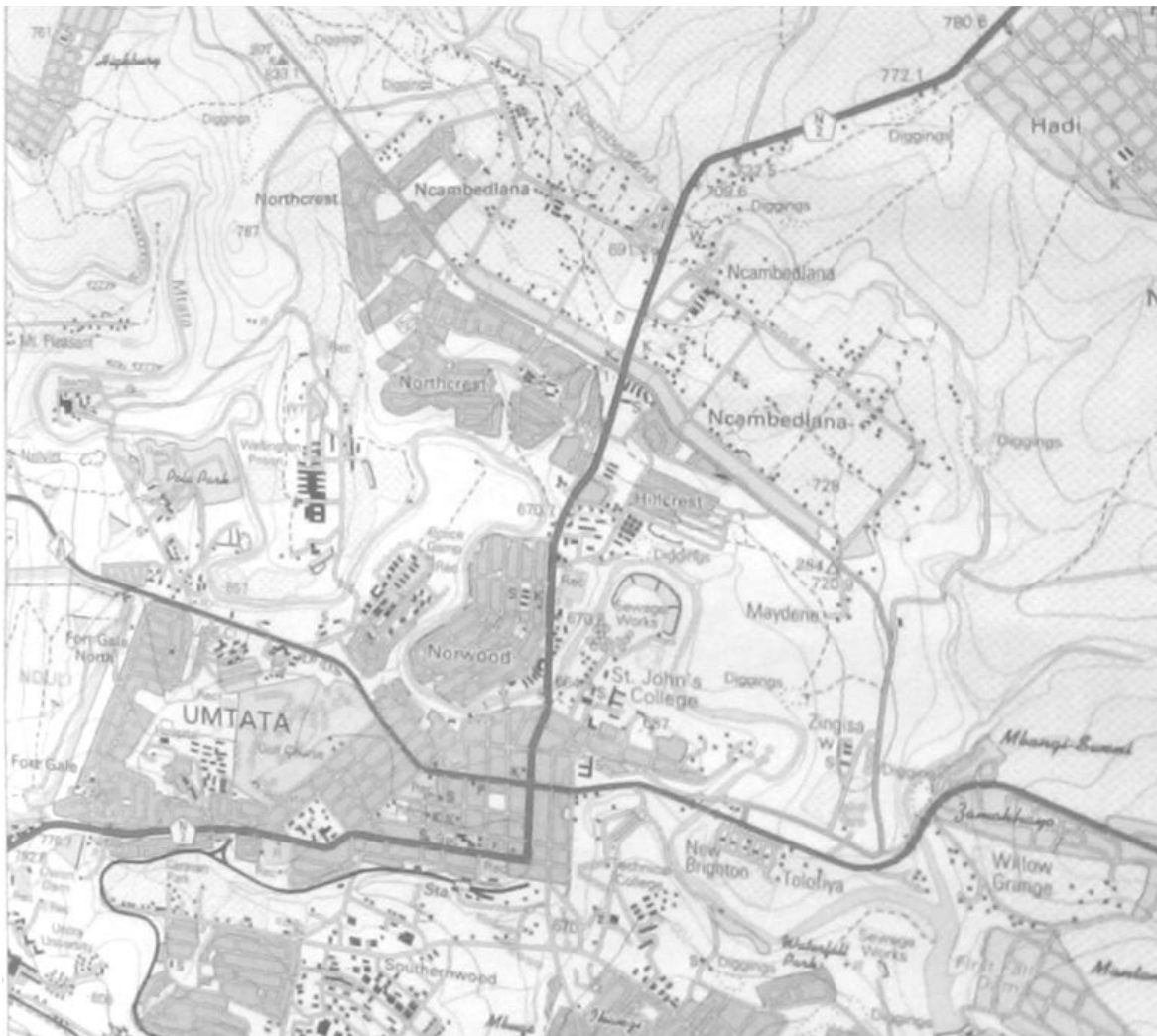
Figure1. Map of Mthatha (1999)