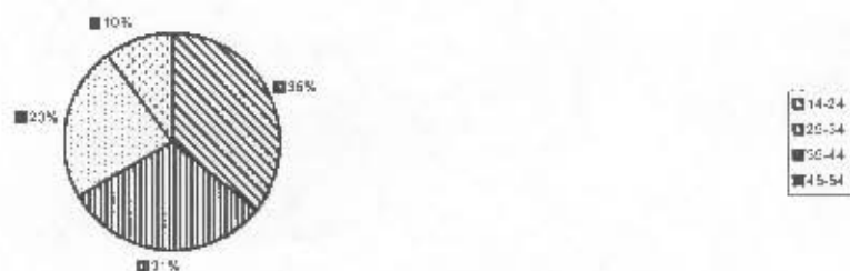
Fig. 1: Age Distribution of Research Participants (n=39)

Because of the group nature of this research, and the focus on service provision rather than in depth exploration of personal experiences, we did not gain a great deal of personal information about participants. The data we did collect was during group icebreaker sessions at the start of each workshop where we asked participants to put together collage ‘portraits’ of themselves. This was meant to be a relaxing, creative exercise but also provided us with basic details such as age and number of children.