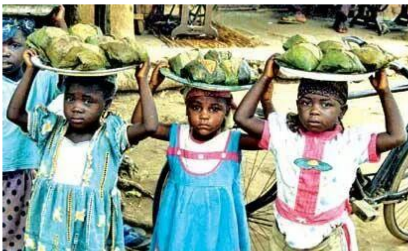
Figure 2: The picture below shows an example of children working as street vendors in Nigeria.

Farming and quarry works is another aspect of child labour in Nigeria, many children especially in the rural areas are found on the farm either working for their parents or hired by some farmers to cultivate on their farm and do some quarries work. 184 This harms the future of the country because children are the future of a nation and child labour hampers the development of a nation.