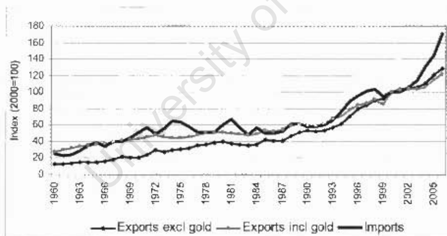
Figure 2: Volume of imports and exports of goods and non-factor services

Trade volumes have also increased following the reintegration of South Africa into the global economy. As shown in Figure 2, import volumes increased steadily during the 1960s and the early 1970s, supported by the government's import substitution industrialisation strategy. Import levels showed no significant trend in from the early 1970s to the early 1990s. This poor import growth was mainly as a result of the depreciation of the rand and the imposition of import surcharges in the mid-1980s. The recession in the domestic economy in 1989 also contributed towards this poor import growth.