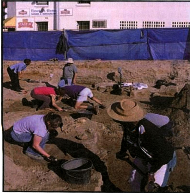
Figure 3 Archaeologists representing the ACO performing exhumation work on site near Prestwich Street.