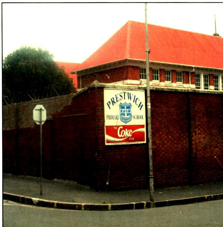
Figure 5 — Photograph of Prestwich Primary School.

In the light of proceedings at the first public meeting, it was decided by SAHRA to suspend exhumation work. The original exhumation permit was appropriately amended to provide an 'interim cessation of work' until 18 August 2003 (SAHRA 2003g). 'We thought it responsible', Madiba said some months later, 'to react to the mood that we experienced [at the first public meeting]...There was a lot of emotion on the 29th, a lot of anger' (SAHRA 2003d, p. 7). In addition to this key decision, SAHRA extended the public consultation process for two additional weeks, until 31 August, to allow for a more extensive notification and discussion period. During this period, public commentators expressed anger at the image of the exhumations as a fait accompli . The RMF faxed a letter, written by representative Imam MN Davids, to the CSRF, where he spelled out the forum's interest in the site and its position in respect of the ethics of the exhumations.