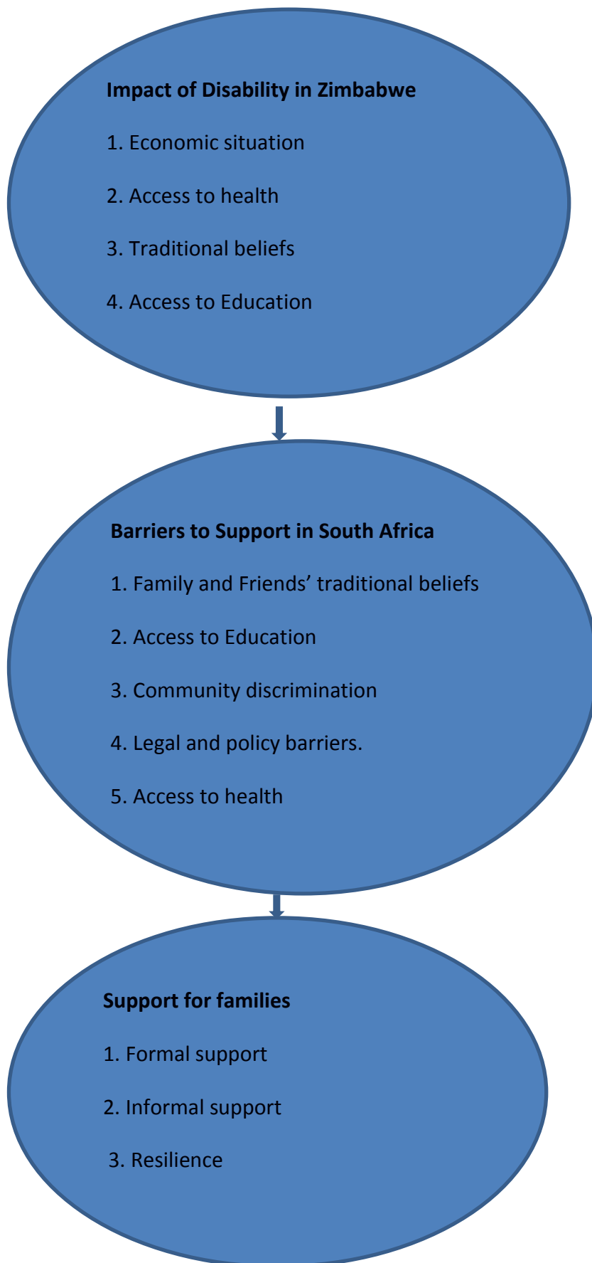
Diagram 1: illustrating the impact of disability for Zimbabwean asylum seekers living in Cape Town with their disabled children.