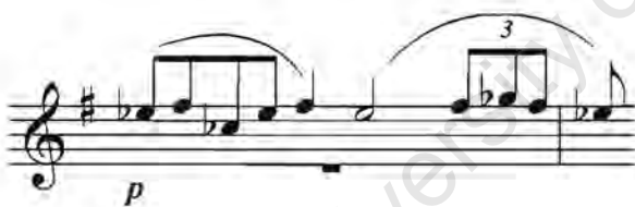
Example 13: Ring motif, Act II, bar 51

The motif associated with the ring appears for the first time in Act II, scene 1, where Pelléas and Mélisande are together at Blindman's Well (Emmanuel, 1926:163). 71 The motif recurs in Act II, bars 73 and 120-121.