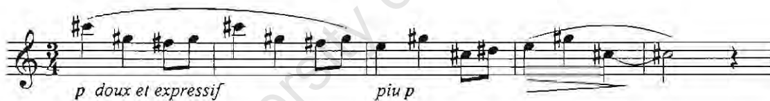
Example 11: Yniold motif, Act 422-426