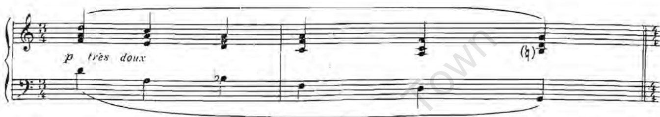
Example 16: Theme of pardon, Act V, bars 99-100

A simple motif, harmonised by triads, occurs at the moment Golaud asks for Mélisande's forgiveness in Act V (Emmanuel, 1926:203). 76