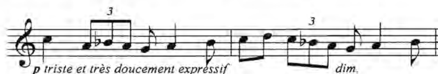
Example 15: Theme of rebirth, Act V, bars 64-65

The theme seems to echo both the Mélisande and Golaud motifs in that the first four notes resemble Mélisande's 'arabesque' cell, and the syncopation together with the triplet quavers recall Golaud's motif. The variation of the theme in the next two bars is even more reminiscent of the two motifs. It first appears at Mélisande's reply 'Pourquoi demandez-vous ce la? Je n'ai jamais été mieux portante' (Why do you ask me how I feel? I have never in my life felt better) and then only recurs on Mélisande's observation of her own child: 'Elle ne rit pas. Elle est petite.' (But she does not smile. She is very little). When Arkel tells Golaud: 'Ne restez pas ici, Golaud...Il lui faut le silence, maintenant' (You should not stay here now, Golaud ... It is silence she needs from now on) the theme is stated, after which the final statement accompanies Arkel's command: 'Il ne faut pas que l'enfant reste ici dans cette chambre' (We must not allow the child to remain here in this chamber), and at the first part of Arkel's final words that conclude the opera: 'Il faut qu'il vive, maintenant à sa place ...' (It [the child] must live on now, as things are, and replace her [Mélisande]). 75 Mélisande's motif is heard on 'à sa place' in Violin I.