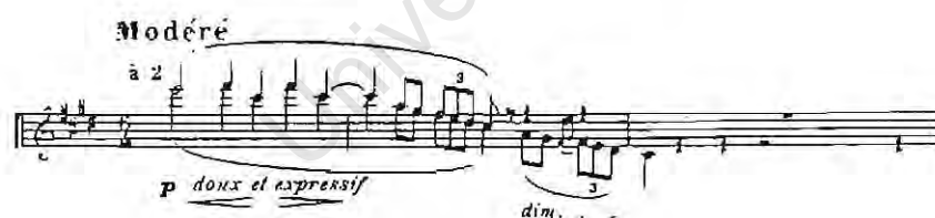
Example 21: Act II, bars 1-3 (arabesque)

Other examples of arabesque figures occur in Act I, where Mélisande’s sadness is reflected in the arabesque in the solo viola, 105 while in Act II, scene 2 Golaud’s anger changes to sorrow after he notices the missing ring. Here something greater than material