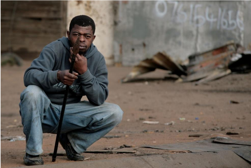
Figure 13. Unidentified perpetrators.