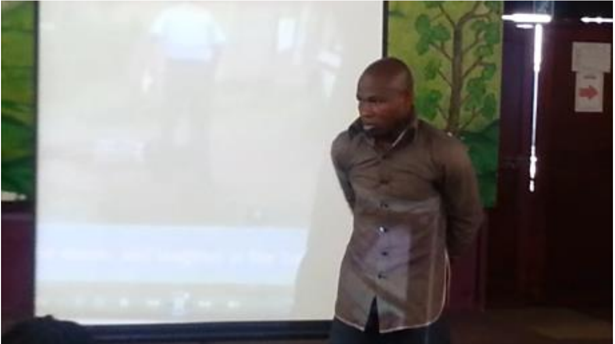
Figure 22. Performer enacting the projected multimedia footage of migrant arrest and police brutality.