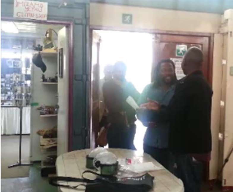
Figure 20. Audiences going through a 'border checkpoint' in Asylum:Section 22.