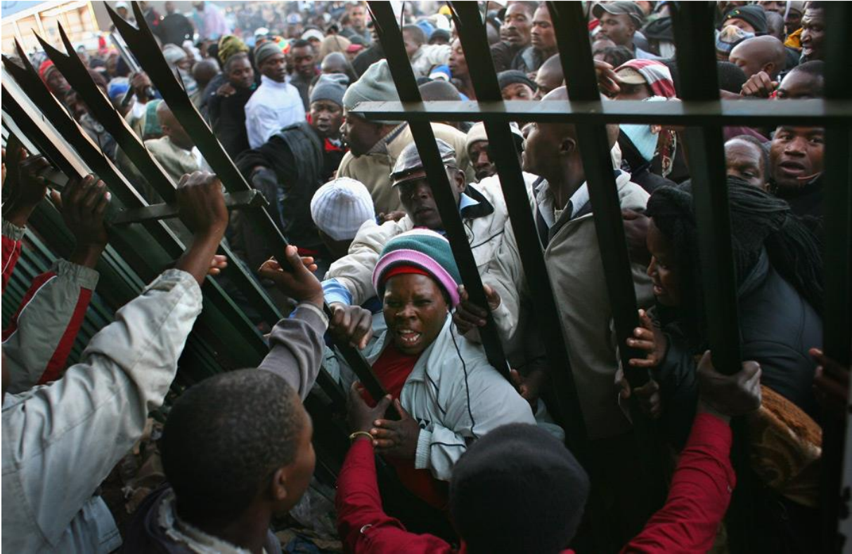
Figure 17. Displaced migrants looking for sanctuary.