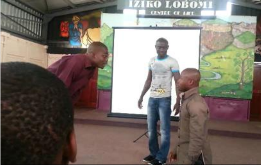
Figure 23. a and b. Migrant being interrogated by detained criminals in police detention.