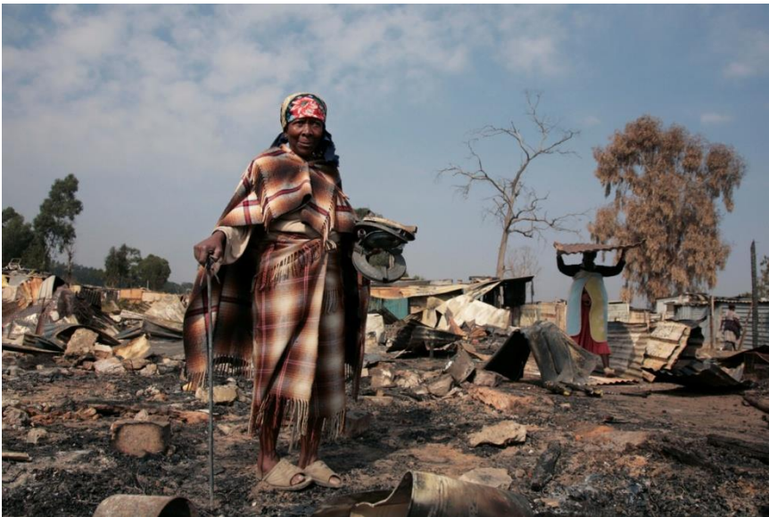
Figure 15. Identified displaced baSotho women by Nadine Hutton.