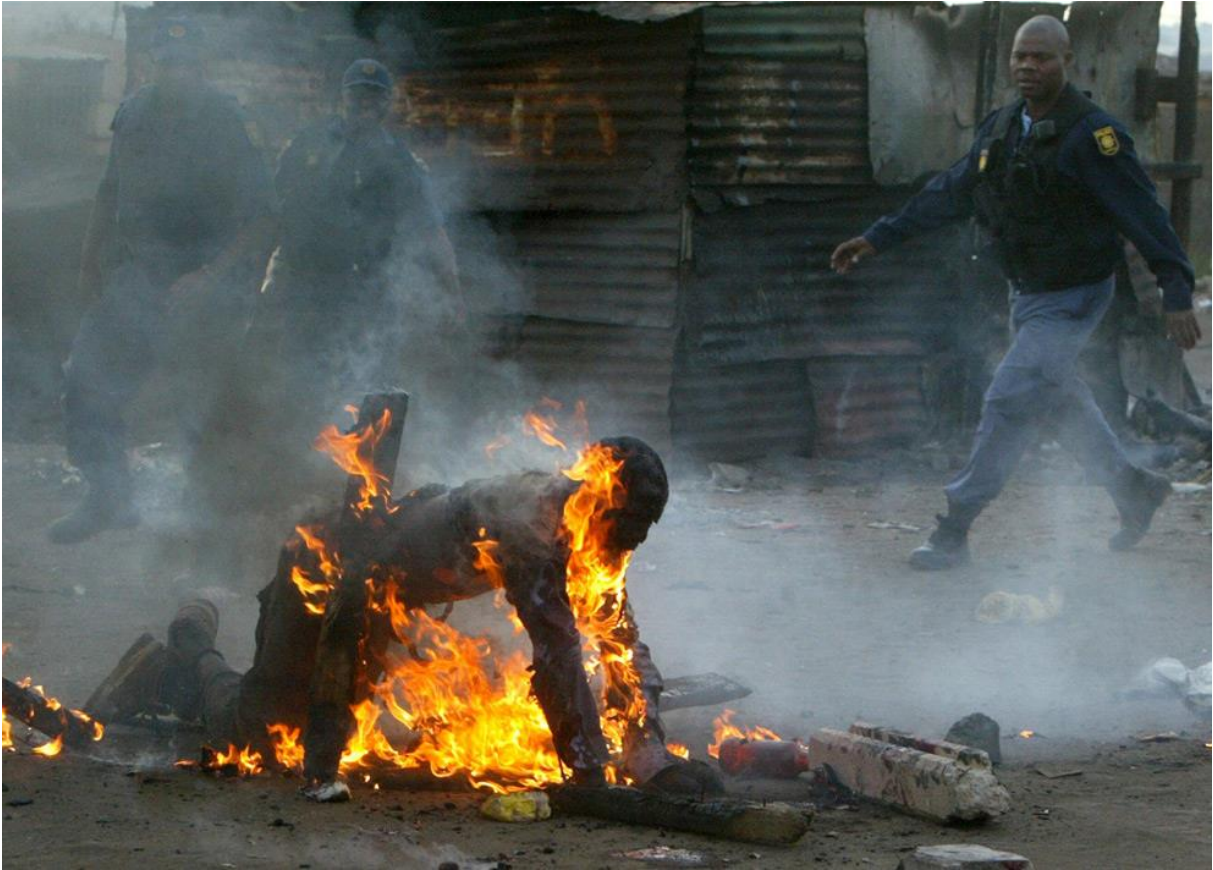
Figure 16. Ernesto Nhamuave.