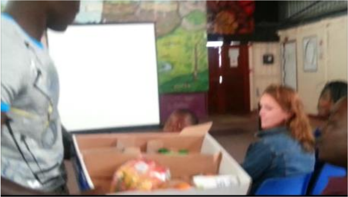
Figure 21. Scene from Asylum:Section 22