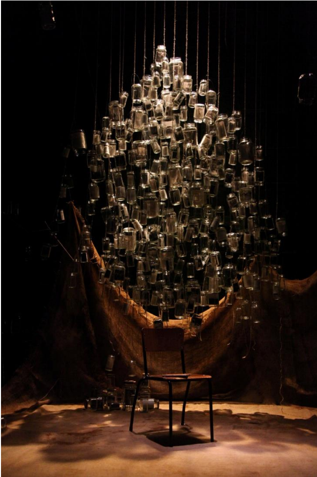
Figure 12 a and b Set design from The Line .