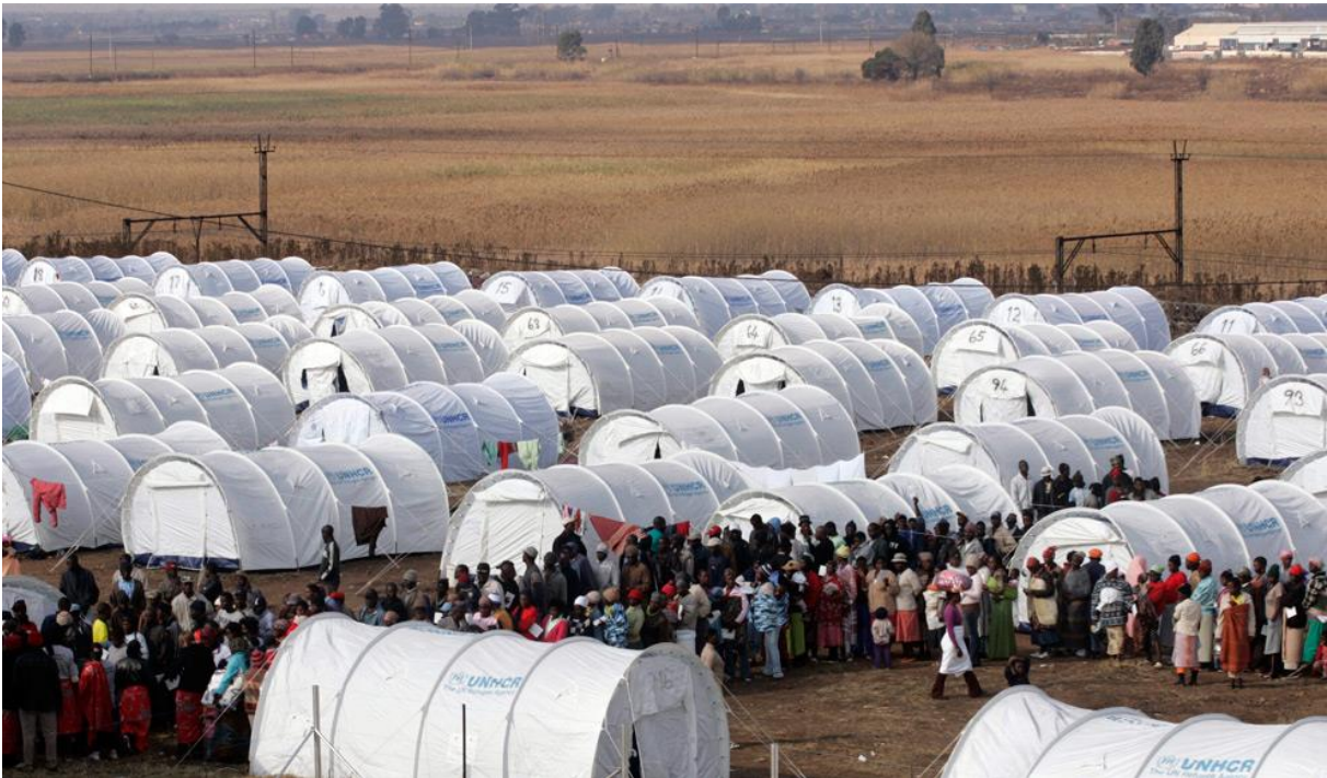
Figure 18. Make shift camps for displaced migrants.