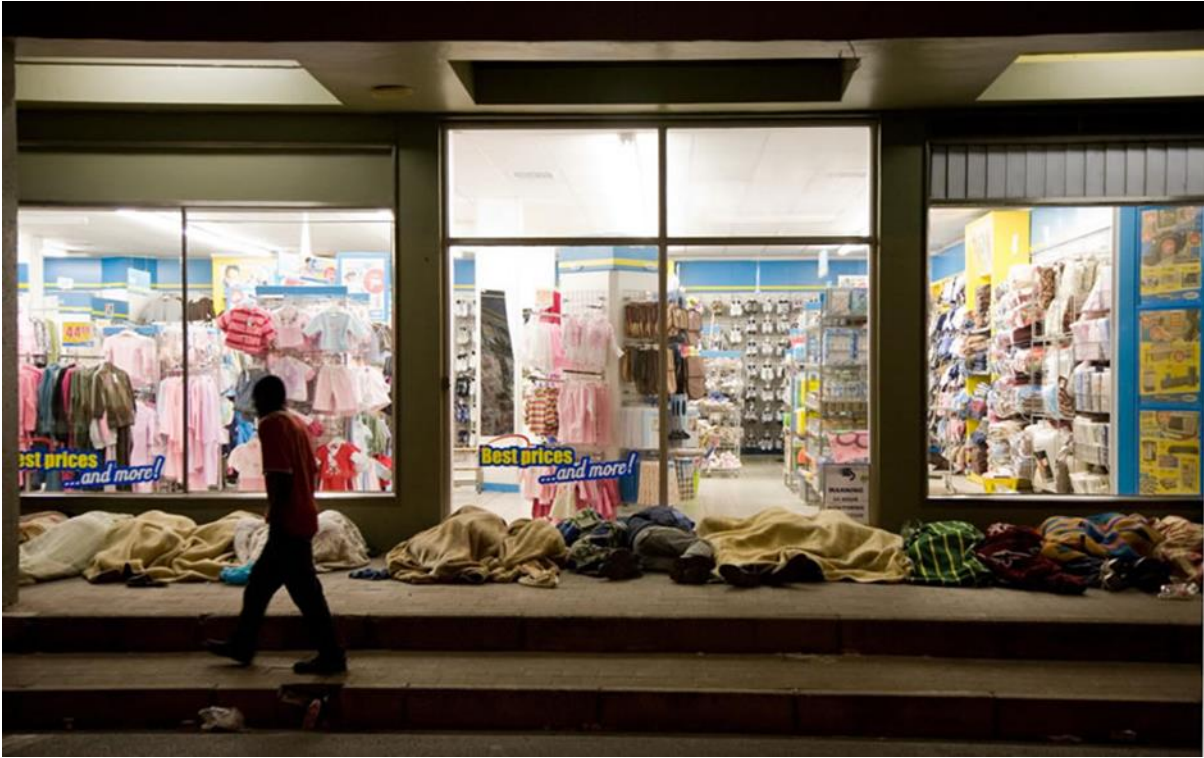
Figure 19. Displaced migrants.