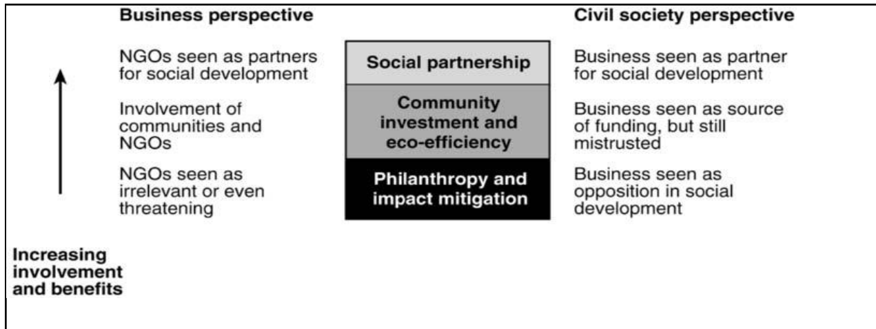
Figure 2.2 Evolution of CSR from Philanthropy to Social Partnership (Hamann 2003)

be used with maximum effect because it is more of a complementary approach where all partners provide their skills and resources according to their capabilities (ibid).