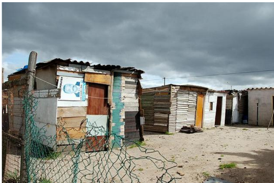
Figure 4.6 Adjoining shacks in Vrygrond