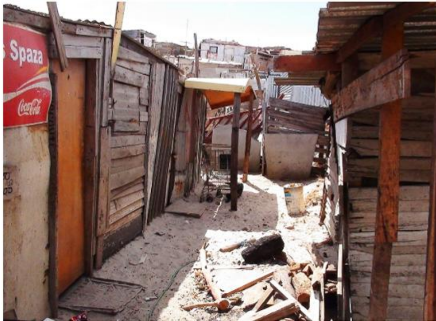
Figure 4.7 Spaza Shop in Overcome Heights

Everything seems to be improvised and not sealed adequately. Alongside the roads are numerous „spaza shops’, small shops such as convenience shops, hair salons, fruit stalls, butcheries (see Figure 4.7).