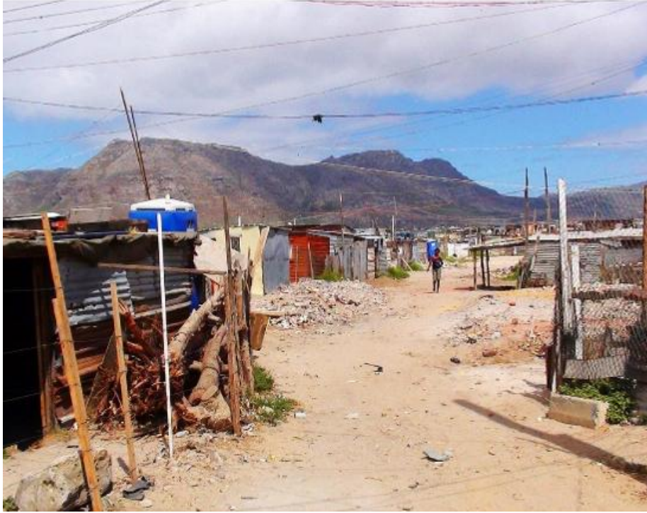
Figure 4.3 Unpaved sand roads in Vrygrond