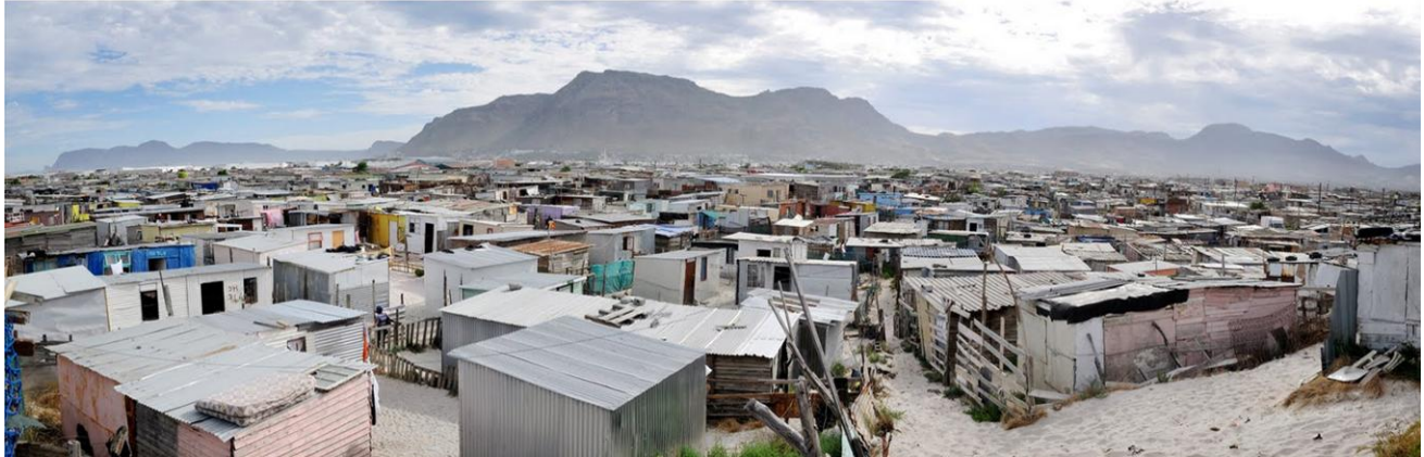
Figure 4.8 View of Overcome Heights in Vrygrond from the top of the sand dunes

area of this community (SCHOOL 2, March 2011) ". Overcome Heights is an extremely poor squatter camp, built on the sand dunes behind Vrygrond. A lot of shacks string together with almost no space between them (see Figure 4.8).