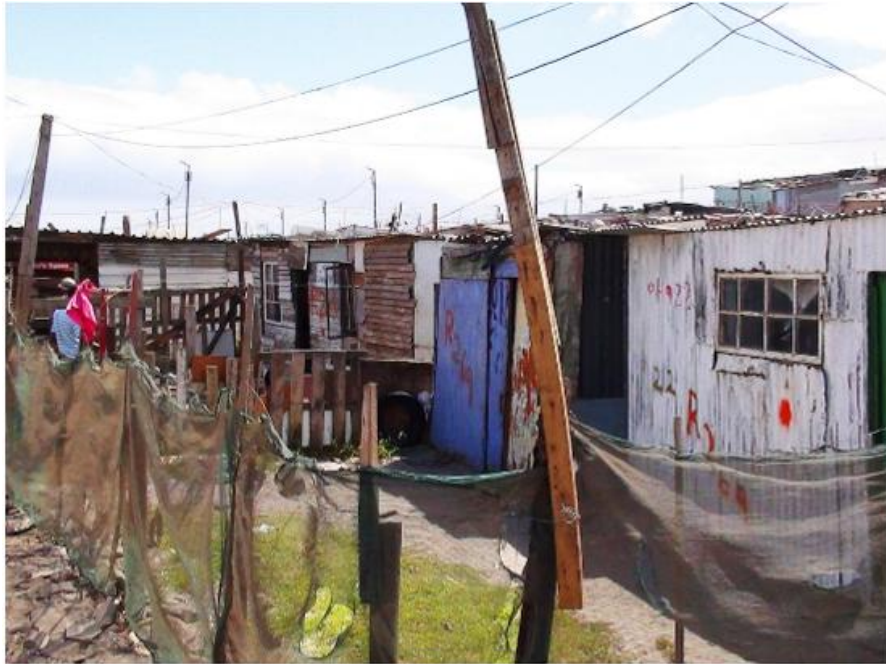
Figure 4.5 Picture of shacks in Vrygrond

So-called ‚shacks’ appear everywhere and they come in different shapes and sizes. Some of them are very rudimental while others seem to be in very good condition. The majority of the houses are made out of wood, corrugated iron and old car tires (see Figure 4.5 and 4.6).