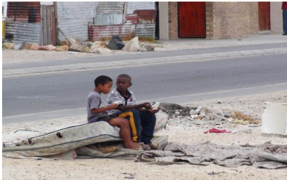
Figure 4.10 A common sight in Vrygrond

ECD is essential in an impoverished area such as Vrygrond, because it sets the foundation for a child's school career, according to the principal (March 2011). "There are so many children that would need such an education. They struggle because they come from Xhosa or Afrikaans families that don't speak English. Without pre-primary schools they fall behind" (TEACH 1, February). This criticism was also in line with one of the board members of the organization. "It