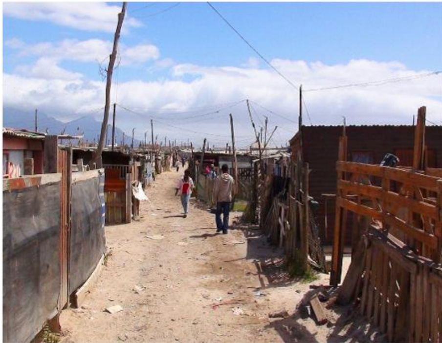
Figure 4.4 Unpaved sand roads in Vrygrond