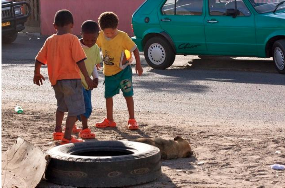
Figure 4.9 Kids playing in the streets