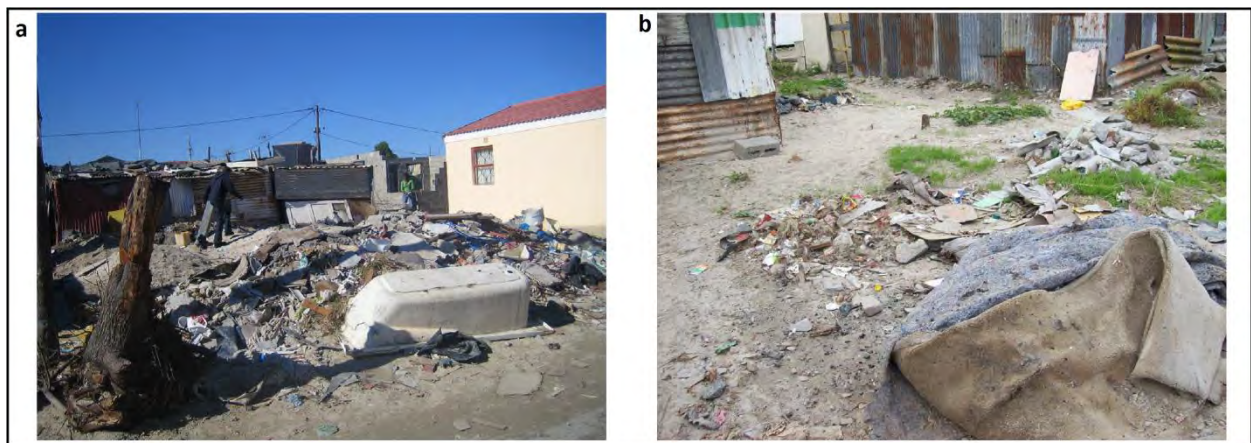
Figure 3. External housing environmental in Khayelitsha

The environment surrounding homes in Khayelitsha and Philippi was observed to be littered with waste and piles of building material including concrete blocks and wooden boards (Figure 3). There was extensive on-going construction in these areas during the research period as new shacks were being built or more rooms were being added to main houses. One participant referred to the piles of neighbour's building materials next to her shack where rats lived and bred as a "rats' paradise." While there were refuse bins provided by the municipality in nearly all plots, much waste remained on the streets and in areas surrounding houses. Flies were the most commonly observed pests around these dumping sites. Dumping site is used here to refer to illegal refuse dumping areas as opposed to landfills which are planned areas for organized refuse disposal. The observation data do not refer to the presence of landfills in the study areas. With houses being so close, in some instances even when refuse bins or other piles of rubbish were placed far from the house they belonged to, they were still in close proximity to neighbouring houses. Some participants, whose houses were observed to be kept clean and neat, complained that the reason why their homes were infested with pests was because of the environment which acted as a pest attractant.