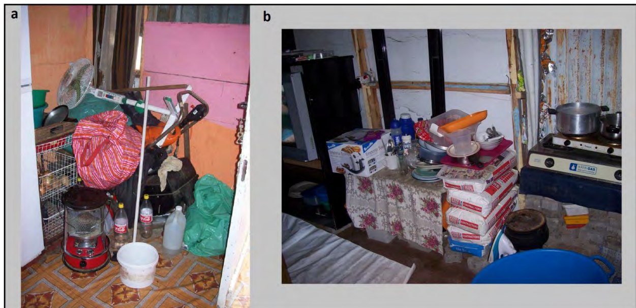
Figure 1. Overcrowding in kitchen areas in homes in Khayelitsha

There were 14 (28%) explicit records of houses in the study, both shacks and permanent houses, whose sizes were very small for the number of occupants and furniture in them. Many shacks consisted of a single room, with furniture used to divide the space into different ‘rooms.’ The result was that the houses were tightly packed with furniture and other household materials and appliances were stacked on top of each other (Figure 1). Due to lack of space, some kitchens had utensils and appliances placed on the floor. While there were some clean and well-kept houses, both shacks and permanent houses, there were more dirty and unkempt houses due to how cluttered and cramped they were. The dirtiness of houses was determined based on observations of stains on floors and carpets, crumbs and unwiped spills on floors and counter tops, and unwashed dishes and pots in the kitchen areas. With the lack of space, many households did not have enough cupboard space and stored food in plastic containers on table tops and on floors, placing food within easy access of pests.