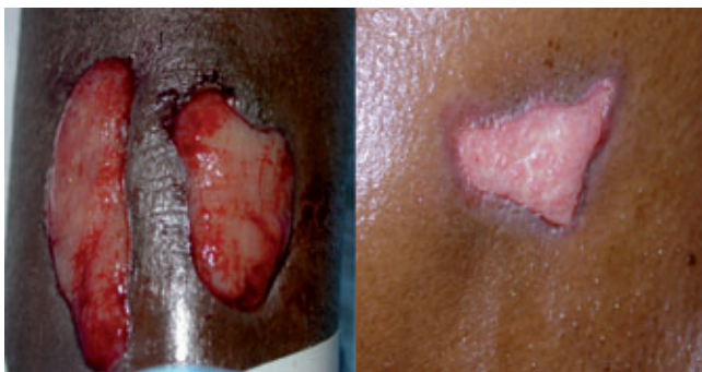
Fig. 1. Lesions at presentation: (left) granulomatous raised ulcers on the elbow; (right) spontaneously healing ulcer on the left side of the neck.

A 31-year-old patient with stage 4 HIV/AIDS presented with recurrent painful skin ulcers for more than 8 months. These would start as subcutaneous skin nodules, later becoming fluctuant and suppurating and then healing spontaneously (Fig. 1). The patient had lesions on the left wrist, left posterior thigh, right axilla, right posterior calf and right upper eyelid. He had also been diagnosed with extrapulmonary tuberculosis and had been on highly active antiretroviral therapy (HAART) for 8 months and antituberculosis medication (continuation phase). After initial poor adherence to both groups of drugs, compliance had improved. The CD4 count at baseline was 16 cells/ \mu l and the latest result was 80 cells/ \mu l. Histological analysis of a biopsy specimen taken from the right upper eyelid lesion showed granulation tissue with some acute inflammation. Fungal spores were seen in the exudates and stains revealed 'capsule-deficient' fungi that were first thought to be Histoplasma , and were reported as such.