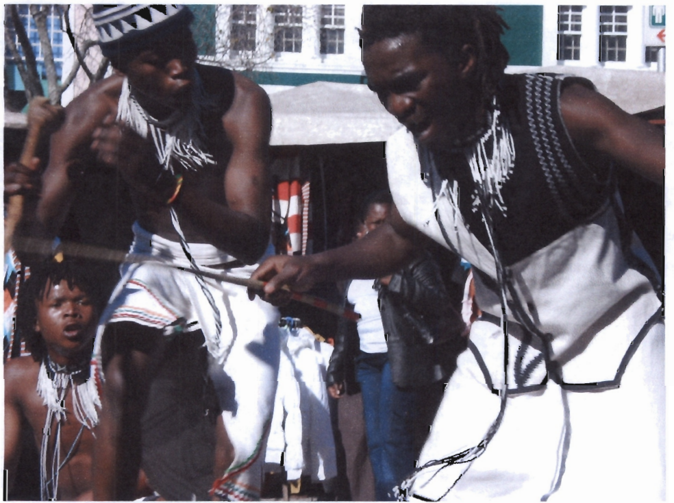
Members of the Impala Cultural Group performing

In chapter one I proposed that the streets of South Africa would be a good place to find humanity. They are.