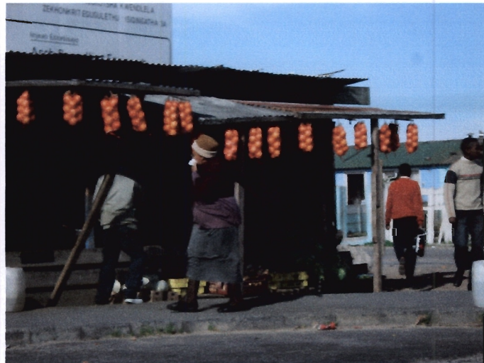
A stall in Guguletu

Many of South Africa's townships are sprawling informal suburbs tacked around the edges of more affluent areas and, although the government is making efforts to provide housing, clean water, electricity