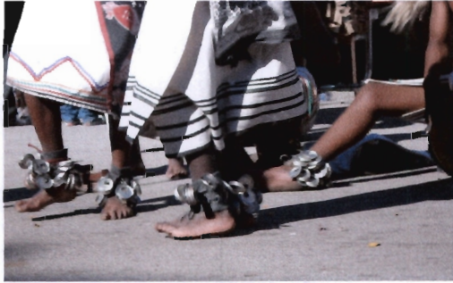
The ankle bracelets of the Impala Cultural Group

The first thing I hear is the rhythmic 'chink-ka-chink' of tin-can-top ankle bracelets.