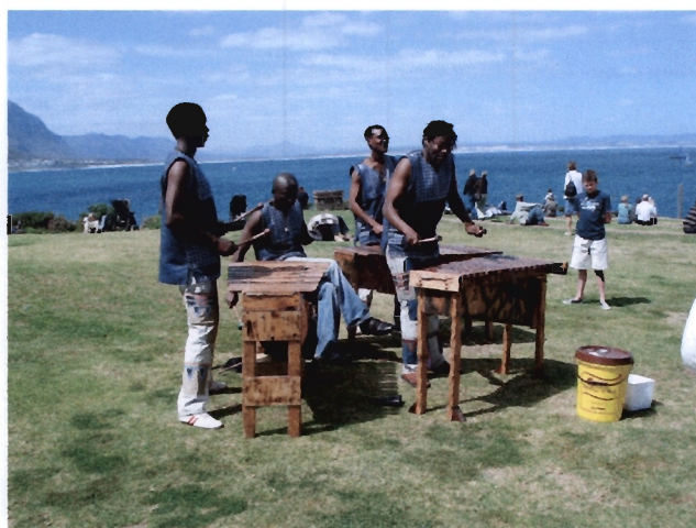
Members of the African Dream Marimba Band in Hermanus

I stand in the warm sunlight, waiting for them as they finish their final preparations before beginning to play yet another lively set, and I know that no