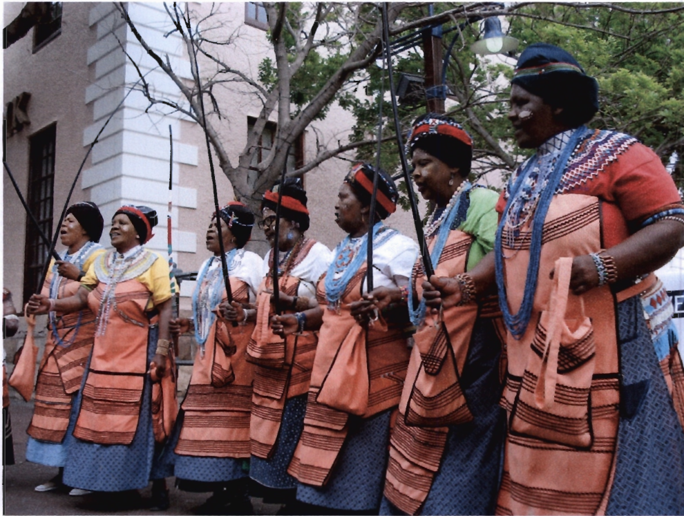
The VukuZenzele woman's singing group

The small audience that has gathered to stare at this wordless performance is silent and still. Positioned directly across from a double-storey building with a glass front and a large overhung entranceway, the VukuZenzele woman's group have created an acoustic catchment area by throwing their voices against the glass; anyone who attempts to walk past enters an arresting, humming zone of sound.