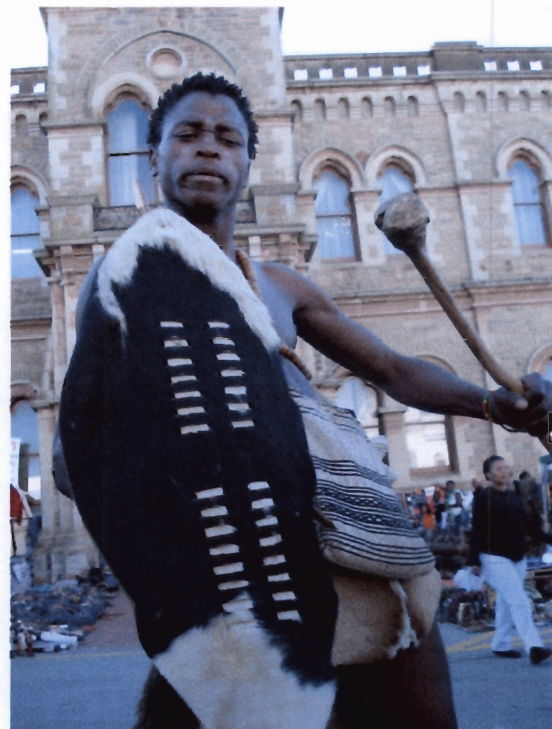
An Impala member demonstrating Zulu weaponry

'Now all their descendants... they proudly carried his name. The Zulu tribe.'