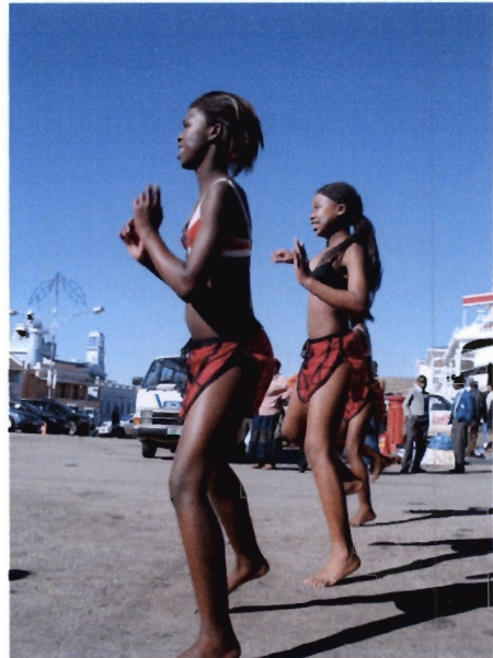
A synchronised performance

catch a lift we hike.’ I understand that ‘hike’ is a less harsh way of telling me they walk. Walk along the highway from Port Elizabeth, carrying their bags and instruments. It is clear that he doesn’t really want to talk about this hardship. He would much rather talk about his music, so I ask what he views his role to be, as leader of the Ubuntu Cultural Dancers, and he lists his tasks, watching me carefully as I write them down. ‘You must not leave off choreographer; it is also important to tell stories.’