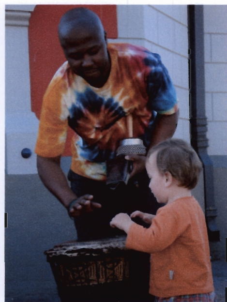
A member of the African Dream band and an interactive audience member

The African Dream Marimba Band have set up a tall, bright yellow drum on top of which their self-produced audio CDs are stacked and displayed for sale. This raises the CDs for easy inspection. Next to this drum sits an empty ice-cream bucket as a collection box. The band don't mind if their audience get close to them and so the