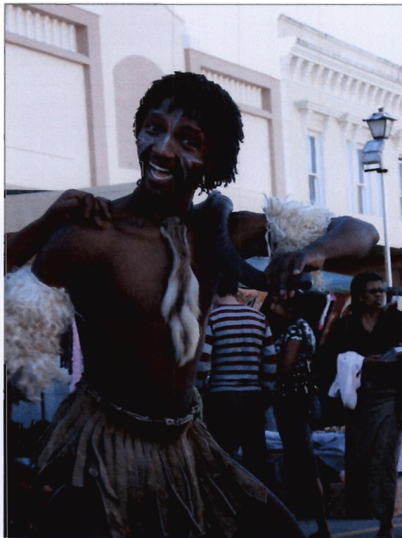
A member of the Impala Cultural Group

Musical flexibility is often and proudly talked of. The Abonwabisi Brothers tell me they are Xhosa, but they sing and perform a predominantly Zulu genre. The Impala Cultural Group alternate their costumes and their material. One day they will