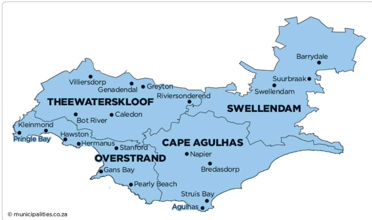
Figure 3.1: Overberg region map