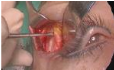
Figure 5: The periosteum is elevated off the orbital rim from laterally to medially around the orbital rim and then off the superior orbital rim