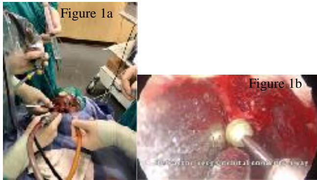
Figure 1a and 1b: Multiportal surgery (1a) using a precaruncular and unilateral endonasal approach to decompress the medial optic nerve canal (right eye). Instruments converge on the target area (1b)