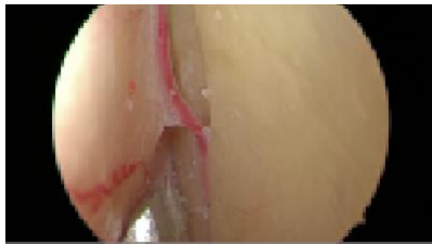
Figures 6: A recurrent branch of the middle meningeal artery in a cadaveric specimen (left eye)