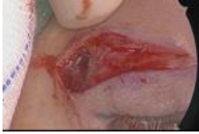
Figure 4: Dissection starts on the lateral orbital rim to prevent damage to the levator muscle