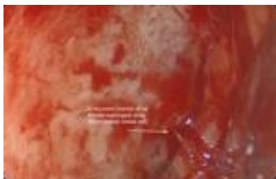
Figure 7: Recurrent branch of the middle meningeal artery (right eye), 1cm anterior to the SOF