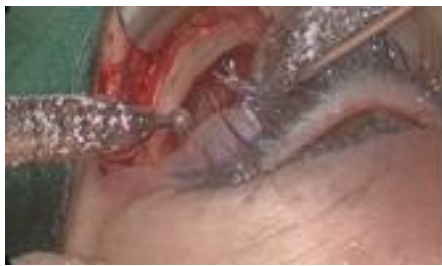
Figure 9: Lacrimal keyhole area is drilled away once the lacrimal gland is dissected out of its fossa