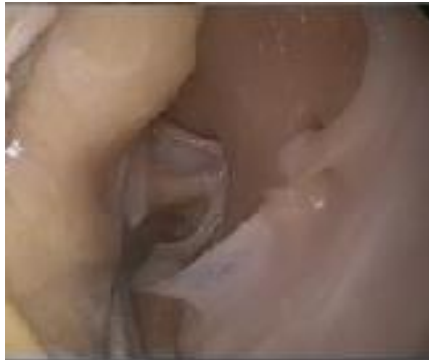
Figure 8: The SOF is 1cm posterior to the recurrent branch of the middle meningeal artery (left eye in cadaveric specimen)