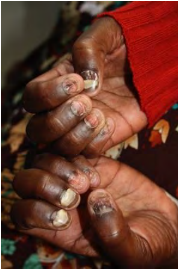
Figure 6. Severe Beau's lines with pterygium of the nails in a patient with resolved Stevens-Johnson syndrome.