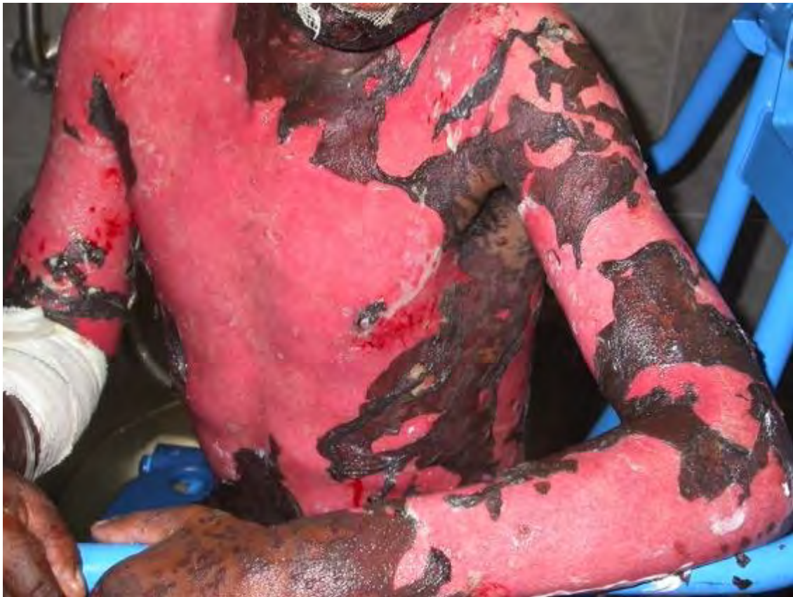
Figure 3. Toxic epidermal necrolysis: Extensive epidermal necrosis and stripping