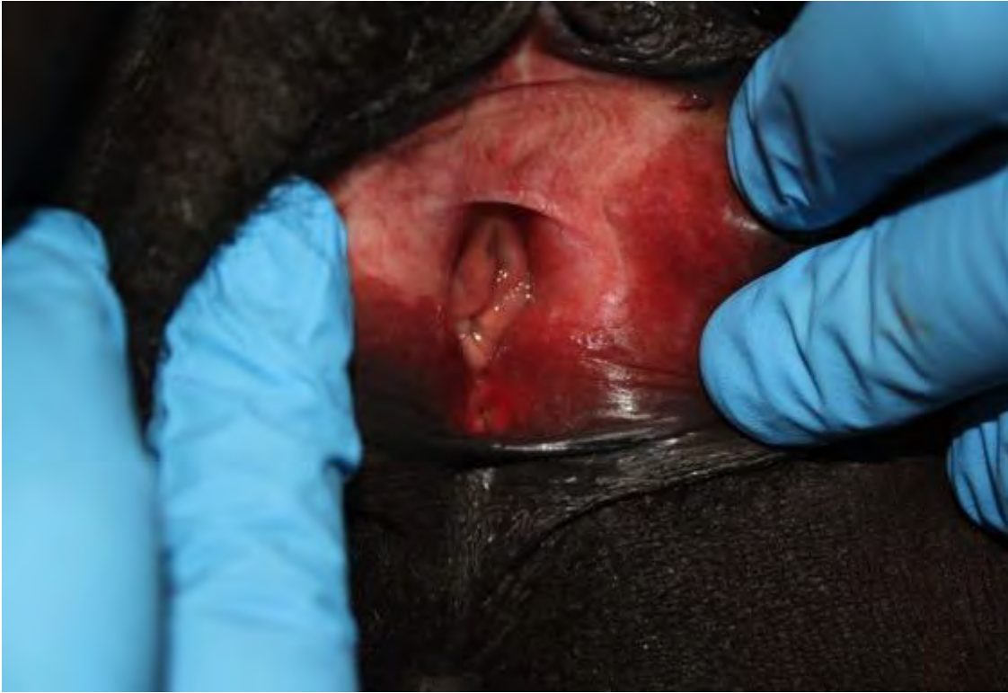
Figure 7. Introital stenosis in a patient with resolved Stevens-Johnson syndrome.