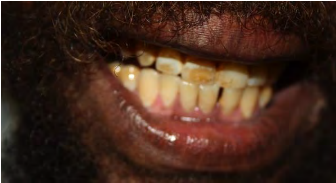
Figure 8. Discolouration of teeth post Stevens Johnson syndrome