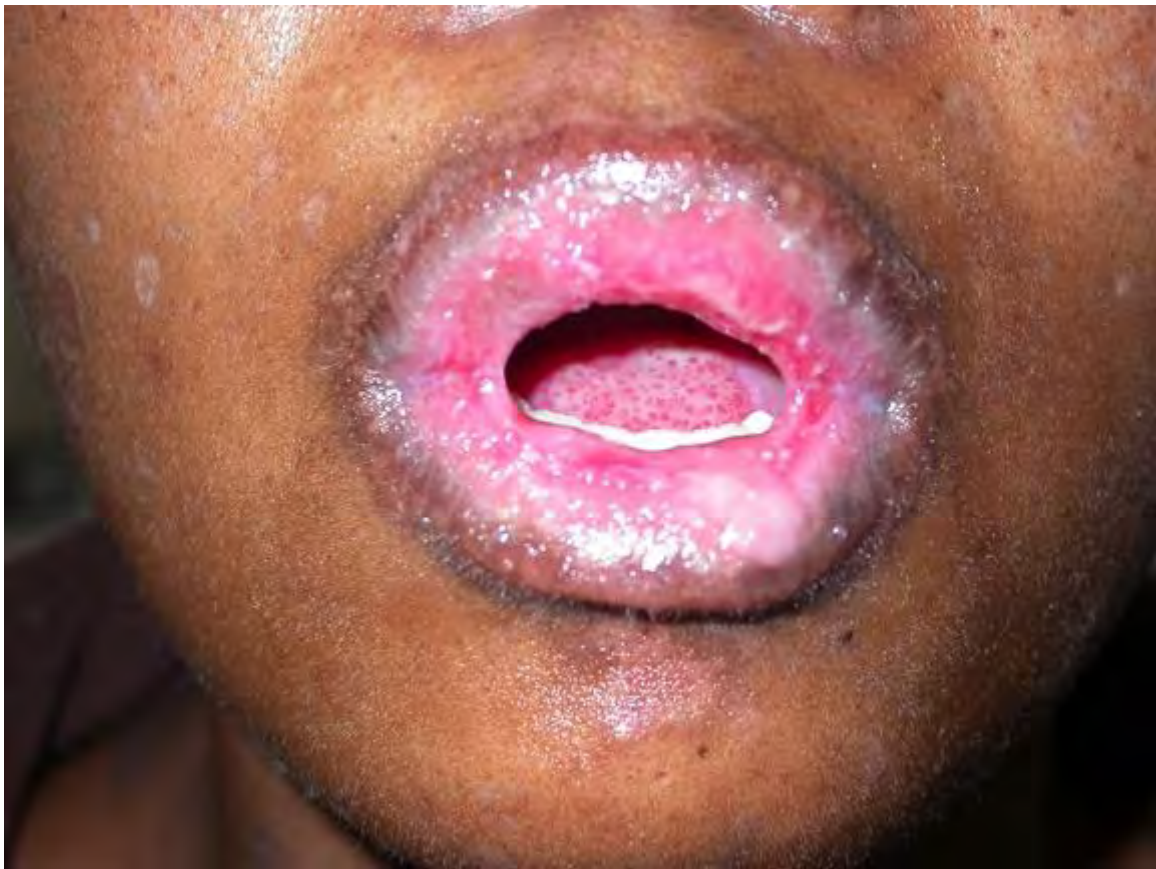
Figure 5. Microstomia in a patient who had severe haemorrhagic cheilitis in associated with Stevens-Johnson syndrome.

pain, but difficulty in taking meals or undergoing dental therapy. Physical examination revealed bilateral fibrotic scar bands on the oral commissures, which narrowed the oral orifice and caused microstomia (Figure 5). They found scar bands located on and medial to the vermillion, where the maximal interlabial and intercommissural distances were measured 25 and 28 mm (Mashiko et al., 2013).