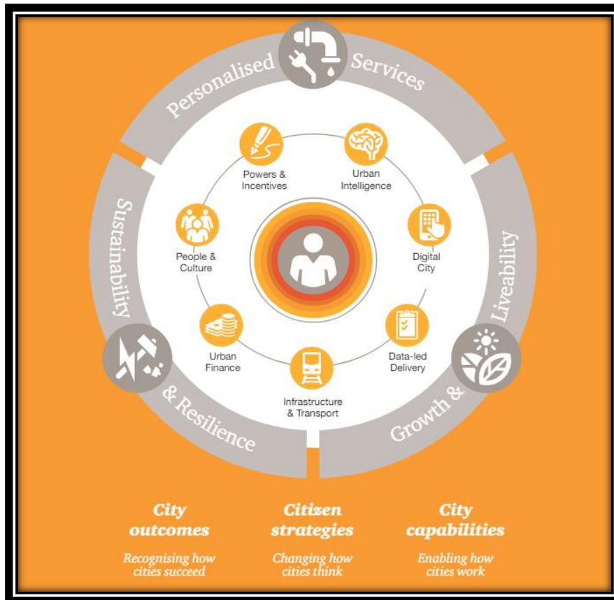
Figure 3: Smart cities model (PwC Africa, 2012)

Their study revealed that the City of Cape Town is equipped with the tools and intangibles to elevate itself should it improve on the implications that stakeholders should invest in. A recurring theme in the development of smart cities is their initiative to stimulate economic growth. In the PwC (n.d.) study, Cape Town was ascertained as a city that stimulates economic growth by means of being a hub for incubators, start-ups, and tech firms. The city at the time possessed over 60% of the country's start-ups and 58% of its venture capital firms. These statistics contributed to the moderate ranking of 22 out of the 31 studies cities worldwide when analysing intellectual capital and innovation. Educational ranking of higher learning institutions also proved vital in rankings and the readiness of a city to be considered smart. The rankings of the University of Cape Town (UCT) and the University of Stellenbosch contributed to the intellectual capital score with an important contribution made by expatriates' expertise and qualifications due to the attractiveness of Cape Town as a location for those wanting to relocate.