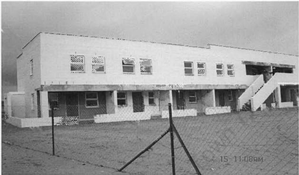
Illustration 5: An example of the walkup units in Joe Slovo 189

When the first phase of the N2 Gateway was handed over, a glamorous media event was held to celebrate the occasion. For this event, the Minister of Housing, Lindiwe Sisulu, asked for the 'maintenance house' on the site to be converted into a crèche for the handover ceremony (for aesthetic purposes). This was duly done even though the cost was over R100 000 as children's play equipment, pictures and new flooring had to be set up. This crèche would, however, never be used. It was situated directly below large power cables, a health risk for the children that would use it and therefore it was never opened. No replacement crèche has been set up 190 . Added to this crèche issue, very few community facilities have been set up in the