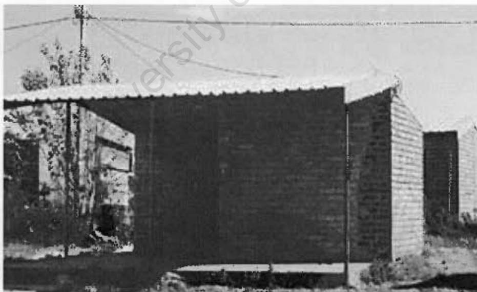
Illustration 1: A Typical Two-room RDP House 34

The sustainability and quality of the houses that were delivered also resulted in some major criticism. This is highlighted by the fact that by 2001, 49 809 housing units had been registered with the Defects Warranty Scheme. Another disturbing statistic that also came about in 1999 was that 'only 30% of houses complied with the standard size of 30m 2 ' 33 .