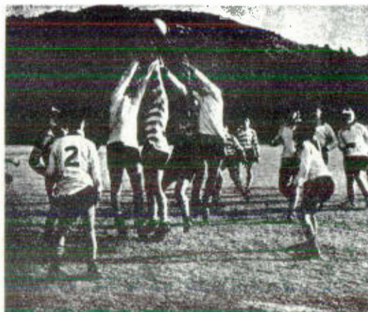
Herzlia vs. King David.