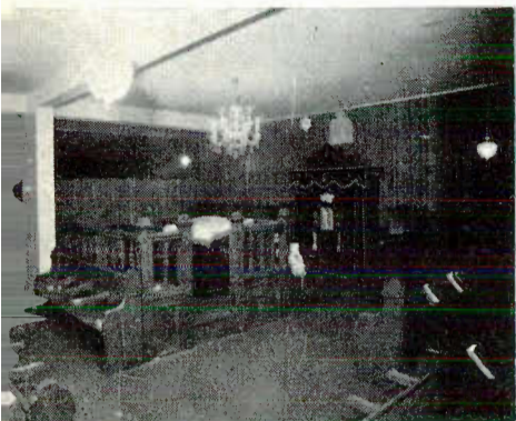
View of interior of Herzlia Synagogue