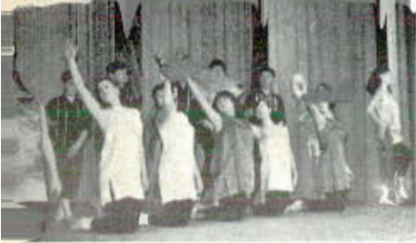
olk-dancing group in typical scene.