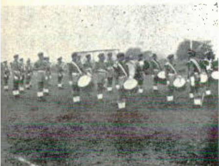
Herzlia Cadet Band.