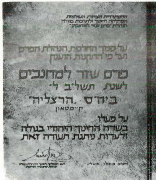
The Shazar Prize for Jewish education in the Diaspora awarded to Herzlia in 1972.