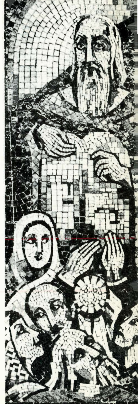
Mosaic in the school hall