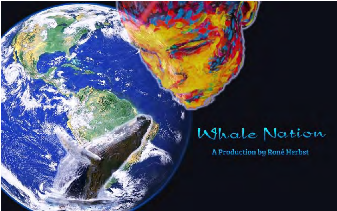
Poster for Advertising