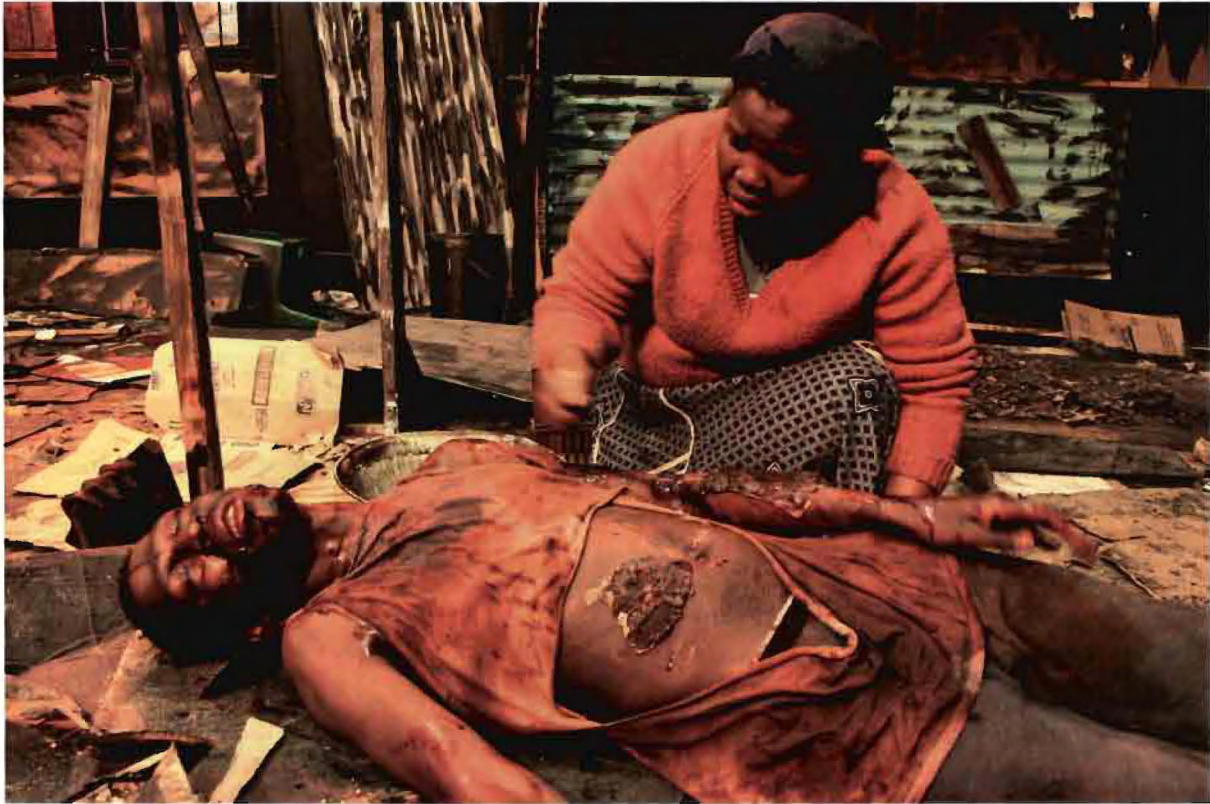
Burnt man and Ma